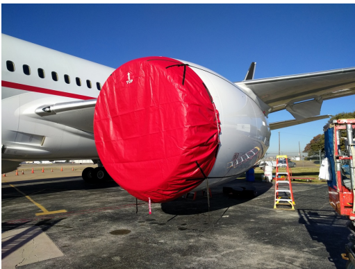
Boeing 787 Intake Cover