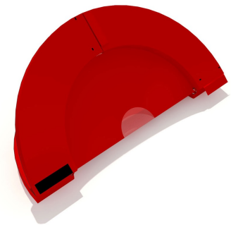
Airbus A330 Intake Plug, framed bi-fold type