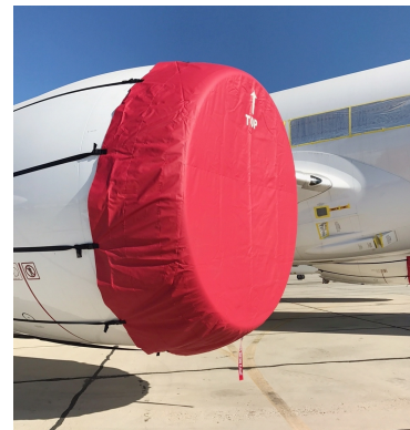
Boeing 787 Dreamliner Intake Covers Kit, Oem Type, Each, Boeing P/N: K10011-1 (Equals Qty 2 Of K10011-2), Adjustable Straps To Bypass Attachment Detail