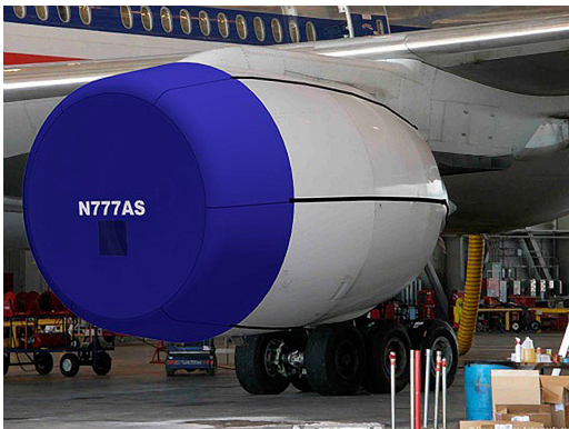
Boeing 777 Intake Cover, GE Engine