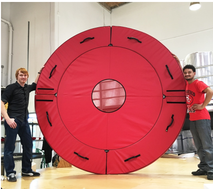
Boeing 787 Intake Plug, framed bi-fold type

The Engine Exhaust Plugs are custom fit for your Boeing 787 Dreamliner exhaust openings, made with heavy-duty vinyl material, and stuffed with a single block of sculpted urethane foam. Each plug has a zipper that allows the foam to be removed and dried if necessary. Exhaust plugs have 'remove before flight' streamers sewn onto the face of the plugs. Most plugs are imprinted with the aircraft registration number in black for an extra charge. Exhaust plugs may be inserted soon after flight when the engine is still warm. Engine Inlet Plugs are commonly referred to as Cowl Plugs, Intake Plugs, Cowl Blocks, Engine Blocks, and Engine Bungs.