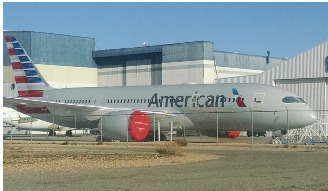
Boeing 787 Intake Covers