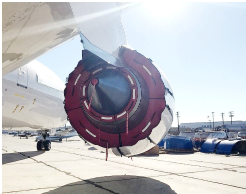
Boeing 787 Dreamliner Bypass Vent, Turbine Exhaust, & Exhaust Nozzle Plugs, Genx Engines

The Engine Exhaust Plugs are custom fit for your Boeing 787 Dreamliner exhaust openings, made with heavy-duty vinyl material, and stuffed with a single block of sculpted urethane foam. Each plug has a zipper that allows the foam to be removed and dried if necessary. Exhaust plugs have 'remove before flight' streamers sewn onto the face of the plugs. Most plugs are imprinted with the aircraft registration number in black for an extra charge. Exhaust plugs may be inserted soon after flight when the engine is still warm. Engine Inlet Plugs are commonly referred to as Cowl Plugs, Intake Plugs, Cowl Blocks, Engine Blocks, and Engine Bungs.