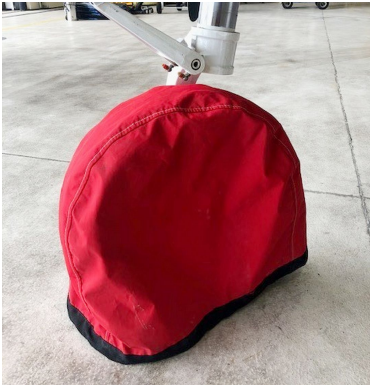
Beech King Air 300 Tire Covers (nose gear)

ALL-YEAR USE MATERIAL - Made with Silver Acrylic Sunbrella canvas, the all-year use material is the best option for sun protection and cover longevity. This heavier more durable material is intended for all weather conditions, such as rain and snow or lots of sun.