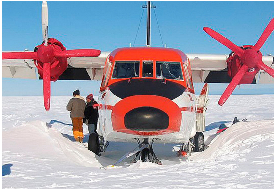
Casa 212 Insulated Engine & Propellor/Spinner Covers

This cover type is made from Silver Acrylic Sunbrella canvas and is 100% lined with a soft and smooth microfiber. Bruce's Custom Covers developed this material combination especially for aircraft protection. The outer material is medium weight and treated for water resistance, UV resistance and anti-static buildup. The inner lining is a very soft and smooth microfiber to prevent scratching. The material is very reflective, and tests show that the cabin interior temperature can be reduced to near-ambient temperature on the hottest of days. It is water, ice and snow repellent, yet breathable to allow moisture to escape from between the cover and the aircraft surface.