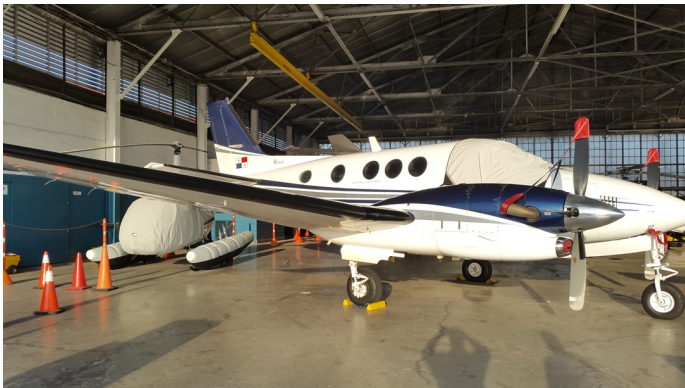
Raytheon Beech King Air Cockpit Cover, Prop Tie/Exhaust Covers, Inlet Plugs