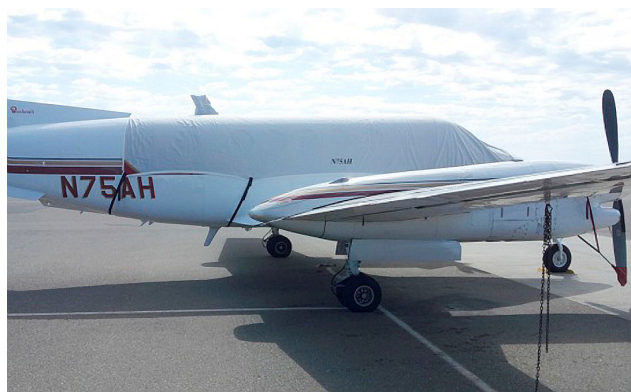
King Air 350 Canopy Cover

Travel Covers are made with Silver Solution-Dyed Polyester fabric and only lined over the windshield to save weight. The material is lightweight and more compact for easy stowage in the aircraft. The polyester material is water resistant, but only intended for occasional use outside. We also have an ultra lightweight material available for fitted hangar dust covers. For daily outdoor use, the non-travel Sunbrella Cover is the best choice.