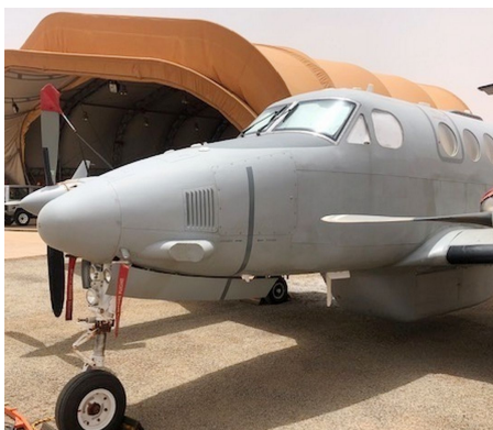
Beech King Air Cockpit HeatShields

Heatshields are interior sunshades for an aircraft's windows or canopy glass. The product is a unique composite of closed-cell foam with a silver mylar finish. The semi-rigid design is stiff enough to stand along the inside of the windshield using sun visors or window framing. It folds up flat and easily stores in the included storage sleeve. Some designs may require velcro and suction cups. A Heatshield is an excellent short-term remedy for cockpit overheating.