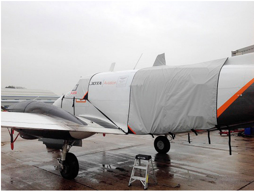
King Air Cargo/Jump Door Rain Cover

The material is very reflective, and tests show that the cabin interior temperature can be reduced to near-ambient temperature on the hottest of days. It is water, ice and snow repellent, yet breathable to allow moisture to escape from between the cover and the aircraft surface.