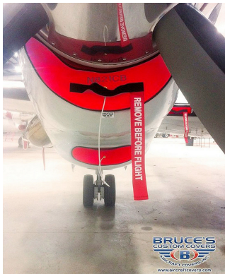
Engine and Oil Cooler Inlet Plugs

Engine Inlet Plugs are custom fit for your Beech King Air 90 & 100 (U-21, RU-21, T-44) intakes, made with heavy-duty vinyl material, and stuffed with a single block of sculpted urethane foam. Each plug has a zipper that allows the foam to be removed and dried if necessary. Engine plugs have warning flags that are visible from the cockpit or 'remove before flight' streamers sewn onto the face of the plugs. Most plugs are imprinted with the aircraft registration number in black for an extra charge. Storage bag NOT included. Engine plugs may be inserted after flight when the engine is still warm. Engine Inlet Plugs are commonly referred to as Cowl Plugs, Intake Plugs, Cowl Blocks, Engine Blocks, and Engine Bungs.