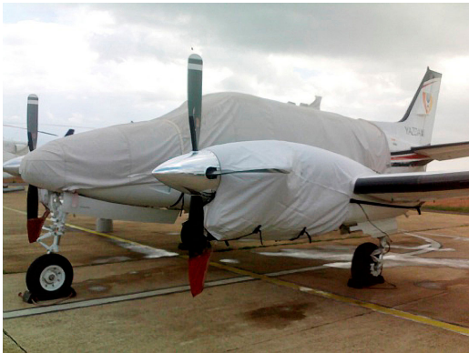
King Air C90 Canopy/Nose Cover, Engine Covers