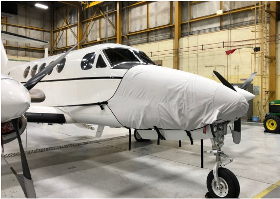
King Air 200 Nose Cover