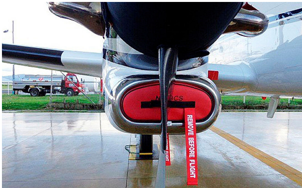
Beech King Air C90B Main Engine Inlet Plug