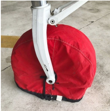
Beech King Air 300 Tire Covers (nose gear)