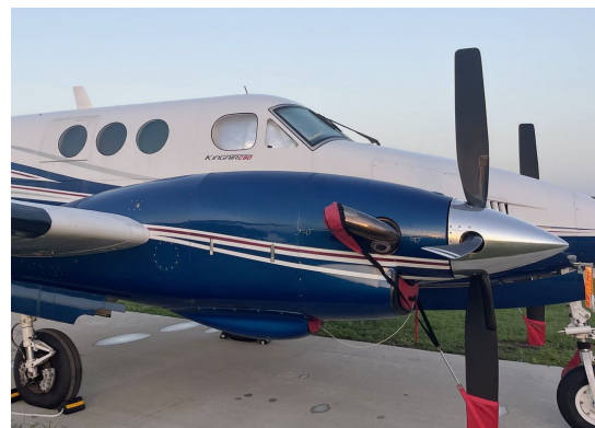
Beech King Air C90 Cockpit HeatShields