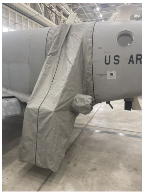
King Air Airstair Coor Cover