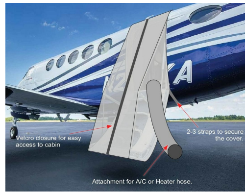
King Air Airstair Coor Cover