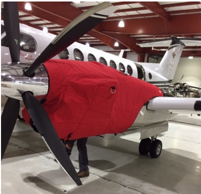
Beech King Air 200 Insulated Engine Cover