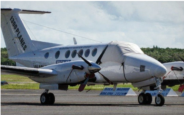
King Air 200

This cover type is made from Silver Acrylic Sunbrella canvas and is 100% lined with a soft and smooth microfiber. Bruce's Custom Covers developed this material combination especially for aircraft protection. The outer material is medium weight and treated for water resistance, UV resistance and anti-static buildup. The inner lining is a very soft and smooth microfiber to prevent scratching. The material is very reflective, and tests show that the cabin interior temperature can be reduced to near-ambient temperature on the hottest of days. It is water, ice and snow repellent, yet breathable to allow moisture to escape from between the cover and the aircraft surface.