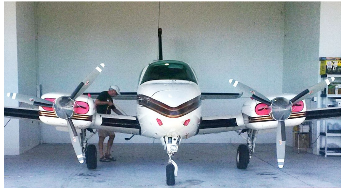
Beech Baron 58 Engine Inlet Plugs, Heater Inlet Plugs