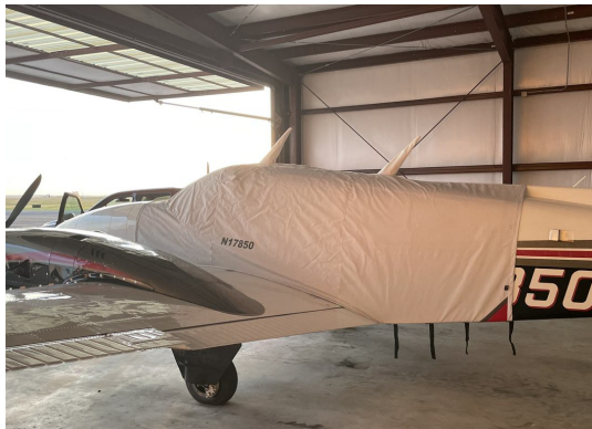
Beech Baron 58TC Extended Canopy Cover

This cover type is made from Silver Acrylic Sunbrella canvas and is 100% lined with a soft and smooth microfiber. Bruce's Custom Covers developed this material combination especially for aircraft protection. The outer material is medium weight and treated for water resistance, UV resistance and anti-static buildup. The inner lining is a very soft and smooth microfiber to prevent scratching. The material is very reflective, and tests show that the cabin interior temperature can be reduced to near-ambient temperature on the hottest of days. It is water, ice and snow repellent, yet breathable to allow moisture to escape from between the cover and the aircraft surface.