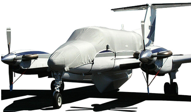
King Air Canopy/Nose Cover

This cover type is made from Silver Acrylic Sunbrella canvas and is 100% lined with a soft and smooth microfiber. Bruce's Custom Covers developed this material combination especially for aircraft protection. The outer material is medium weight and treated for water resistance, UV resistance and anti-static buildup. The inner lining is a very soft and smooth microfiber to prevent scratching. The material is very reflective, and tests show that the cabin interior temperature can be reduced to near-ambient temperature on the hottest of days. It is water, ice and snow repellent, yet breathable to allow moisture to escape from between the cover and the aircraft surface.