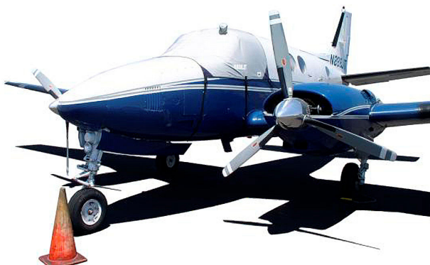
King Air Cockpit Cover, belly-strap type

This cover type is made from Silver Acrylic Sunbrella canvas and is 100% lined with a soft and smooth microfiber. Bruce's Custom Covers developed this material combination especially for aircraft protection. The outer material is medium weight and treated for water resistance, UV resistance and anti-static buildup. The inner lining is a very soft and smooth microfiber to prevent scratching. The material is very reflective, and tests show that the cabin interior temperature can be reduced to near-ambient temperature on the hottest of days. It is water, ice and snow repellent, yet breathable to allow moisture to escape from between the cover and the aircraft surface.