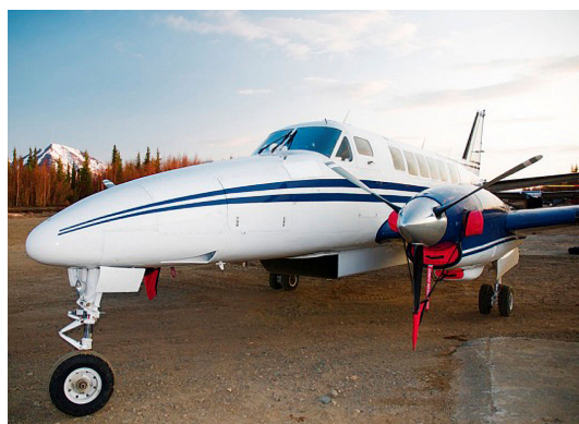
Beech 99 Engine Plugs & Prop Ties