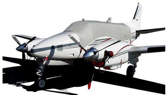
King Air Canopy Cover, Engine Plugs, Prop-Tie/Exhaust Covers