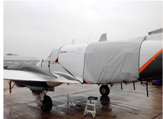
King Air Cargo/Jump Door Rain Cover