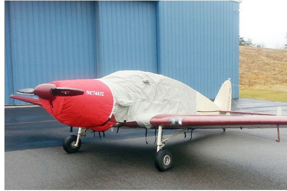
Extended Canopy Cover with Wing Extensions