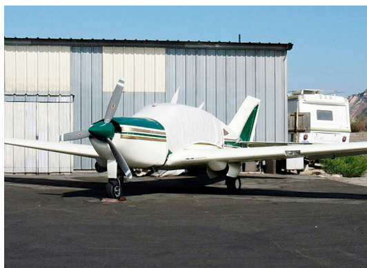
Bellanca Viking Canopy Cover

Travel Covers are made with Silver Solution-Dyed Polyester fabric and only lined over the windshield to save weight. The material is lightweight and more compact for easy stowage in the aircraft. The polyester material is water resistant, but only intended for occasional use outside. We also have an ultra lightweight material available for fitted hangar dust covers. For daily outdoor use, the non-travel Sunbrella Cover is the best choice.