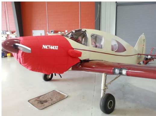
Bellanca Cruisemaster Insulated Engine Cover

This cover type is made from Silver Acrylic Sunbrella canvas and is 100% lined with a soft and smooth microfiber. Bruce's Custom Covers developed this material combination especially for aircraft protection. The outer material is medium weight and treated for water resistance, UV resistance and anti-static buildup. The inner lining is a very soft and smooth microfiber to prevent scratching. The material is very reflective, and tests show that the cabin interior temperature can be reduced to near-ambient temperature on the hottest of days. It is water, ice and snow repellent, yet breathable to allow moisture to escape from between the cover and the aircraft surface.