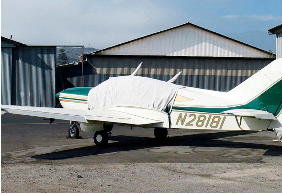
Bellanca Viking Canopy Cover

This cover type is made from Silver Acrylic Sunbrella canvas and is 100% lined with a soft and smooth microfiber. Bruce's Custom Covers developed this material combination especially for aircraft protection. The outer material is medium weight and treated for water resistance, UV resistance and anti-static buildup. The inner lining is a very soft and smooth microfiber to prevent scratching. The material is very reflective, and tests show that the cabin interior temperature can be reduced to near-ambient temperature on the hottest of days. It is water, ice and snow repellent, yet breathable to allow moisture to escape from between the cover and the aircraft surface.