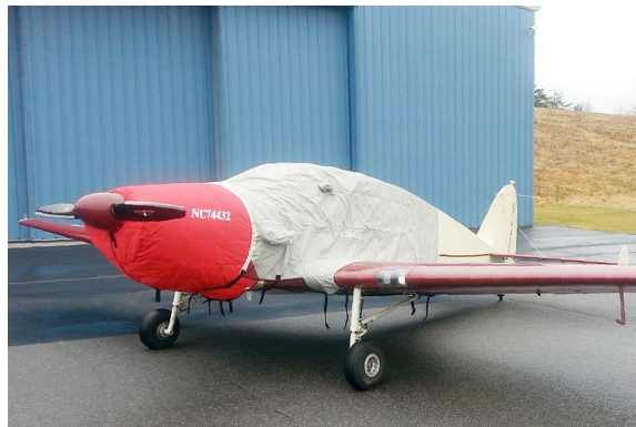
Bellanca Cruisemaster Insulated Engine Cover, Extended Canopy Cover