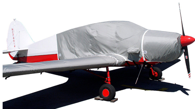
Extended Canopy Cover w/12" Wing Extensions, Engine & Wing Covers

This cover type is made from Silver Acrylic Sunbrella canvas and is 100% lined with a soft and smooth microfiber. Bruce's Custom Covers developed this material combination especially for aircraft protection. The outer material is medium weight and treated for water resistance, UV resistance and anti-static buildup. The inner lining is a very soft and smooth microfiber to prevent scratching. The material is very reflective, and tests show that the cabin interior temperature can be reduced to near-ambient temperature on the hottest of days. It is water, ice and snow repellent, yet breathable to allow moisture to escape from between the cover and the aircraft surface.