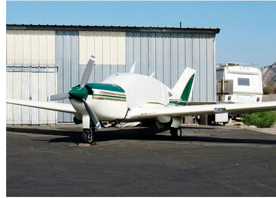
Bellanca Viking Canopy Cover