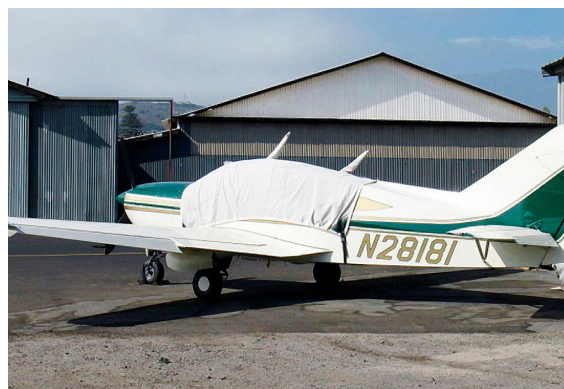
Bellanca Viking Canopy Cover