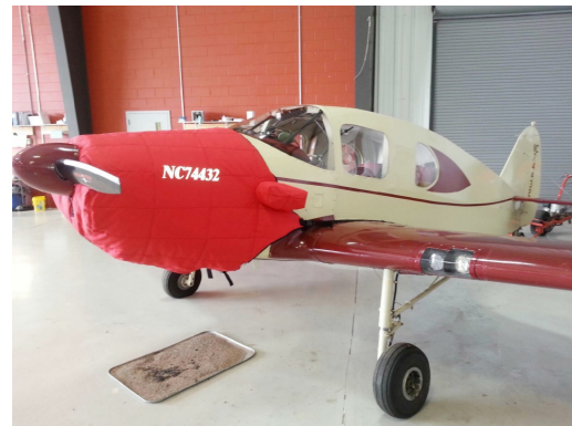
Bellanca Cruisemaster Insulated Engine Cover