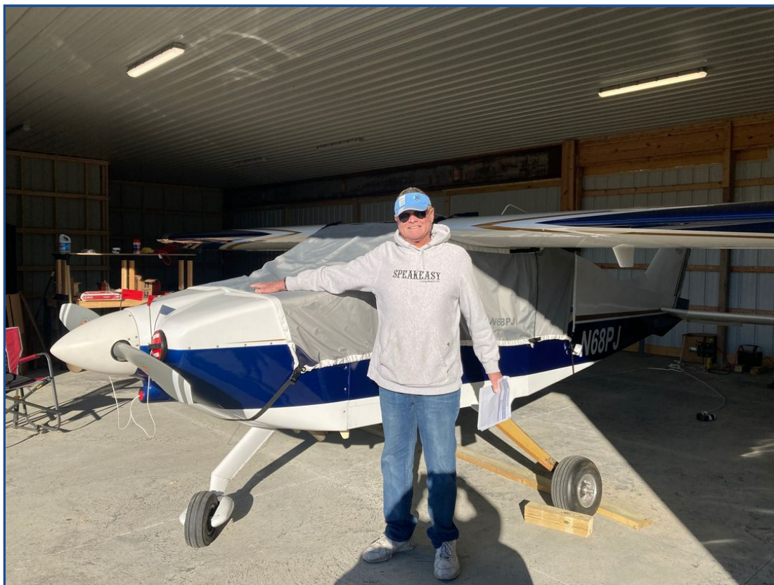
Bede BD-4 Travel Cover, Light Weight Canopy Cover, Wrap-Around