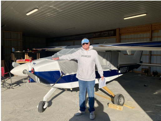
Bede BD-4 Travel Cover, Light Weight Canopy Cover, Wrap-Around