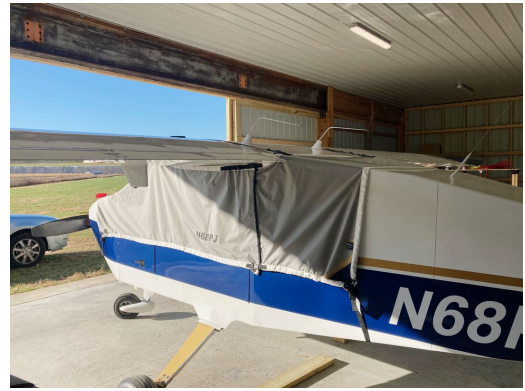
Bede BD-4 Travel Cover, Light Weight Canopy Cover, Wrap-Around