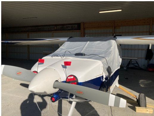
Bede BD-4 Travel Cover, Light Weight Canopy Cover, Wrap-Around

This cover type is made from Silver Acrylic Sunbrella canvas and is 100% lined with a soft and smooth microfiber. Bruce's Custom Covers developed this material combination especially for aircraft protection. The outer material is medium weight and treated for water resistance, UV resistance and anti-static buildup. The inner lining is a very soft and smooth microfiber to prevent scratching. The material is very reflective, and tests show that the cabin interior temperature can be reduced to near-ambient temperature on the hottest of days. It is water, ice and snow repellent, yet breathable to allow moisture to escape from between the cover and the aircraft surface.