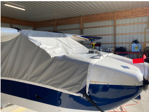
Bede BD-4 Travel Cover, Light Weight Canopy Cover, Wrap-Around