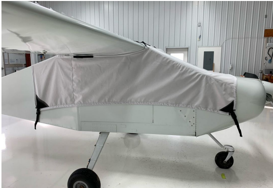
Bede BD-4 Canopy Cover

water resistance, UV resistance and anti-static buildup. The inner lining is a very soft and smooth microfiber to prevent scratching. The material is very reflective, and tests show that the cabin interior temperature can be reduced to near-ambient temperature on the hottest of days. It is water, ice and snow repellent, yet breathable to allow moisture to escape from between the cover and the aircraft surface.