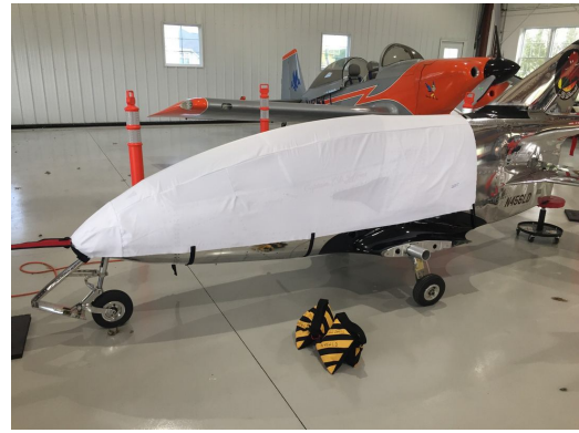
Bede BD-5 Canopy/Nose Cover, test fit cover