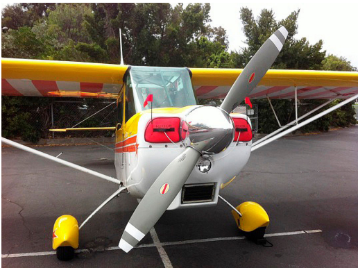
Bellanca Citabria Engine Plugs

Engine Inlet Plugs are custom fit for your Bellanca (American Champion) Decathlon intakes, made with heavy-duty vinyl material, and stuffed with a single block of sculpted urethane foam. Each plug has a zipper that allows the foam to be removed and dried if necessary. Engine plugs have warning flags that are visible from the cockpit or 'remove before flight' streamers sewn onto the face of the plugs. Most plugs are imprinted with the aircraft registration number in black for an extra charge. Storage bag NOT included. Engine plugs may be inserted after flight when the engine is still warm. Engine Inlet Plugs are commonly referred to as Cowl Plugs, Intake Plugs, Cowl Blocks, Engine Blocks, and Engine Bungs.