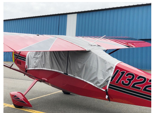
Bellanca (American Champion) Decathlon Travel Cover, Light Weight Canopy Cover Bellanca Decathlon Travel Canopy Cover