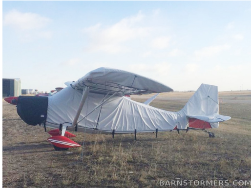
Bellanca Citabria Extended Canopy Cover (extended to tail), Empennage, Wing, Insulated Engine Cover

This cover type is made from Silver Acrylic Sunbrella canvas and is 100% lined with a soft and smooth microfiber. Bruce's Custom Covers developed this material combination especially for aircraft protection. The outer material is medium weight and treated for water resistance, UV resistance and anti-static buildup. The inner lining is a very soft and smooth microfiber to prevent scratching. The material is very reflective, and tests show that the cabin interior temperature can be reduced to near-ambient temperature on the hottest of days. It is water, ice and snow repellent, yet breathable to allow moisture to escape from between the cover and the aircraft surface.