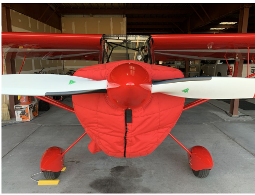
American Champion 8KCAB Insulated Engine Cover