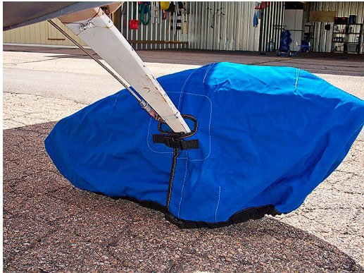
Bellanca Citabria Wheelpant Cover