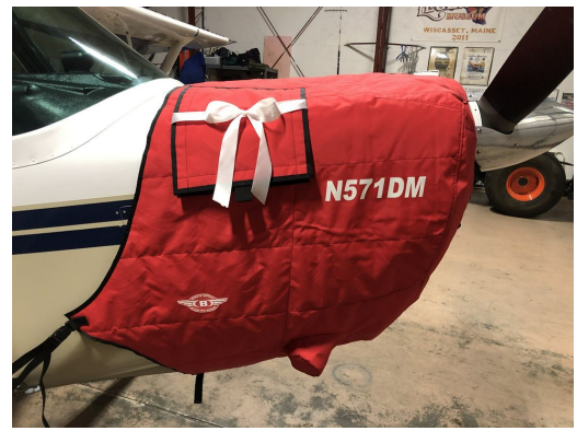
Bellanca Citabria Insulated Engine Cover