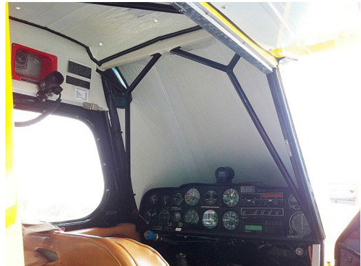
Bellanca Citabria Windshield & Skylight HeatShields