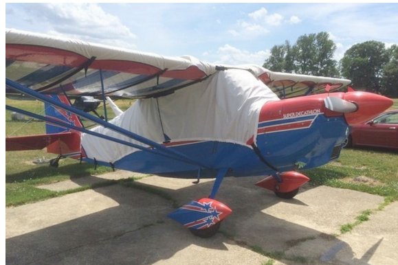
Bellanca Decathlon Canopy Cover (Over-Top, Extended to tail), Wing Covers, Engine Plugs