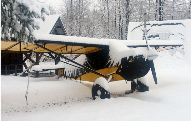
Bellanca 7GCBC Winter Use Cover Set

WINTER USE MATERIAL - Made with Solution-Dyed Polyester fabric, this option is intended for seasonal use to aid in deicing, rain mitigation, or for occasional travel. The material is lighter and more compact, but more susceptible to UV damage and may have a shorter useful life if used continuously outside than the all-year use material.