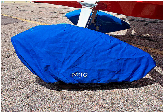
Bellanca Citabria Wheelpant Cover

ALL-YEAR USE MATERIAL - Made with Silver Acrylic Sunbrella canvas, the all-year use material is the best option for sun protection and cover longevity. This heavier more durable material is intended for all weather conditions, such as rain and snow or lots of sun.