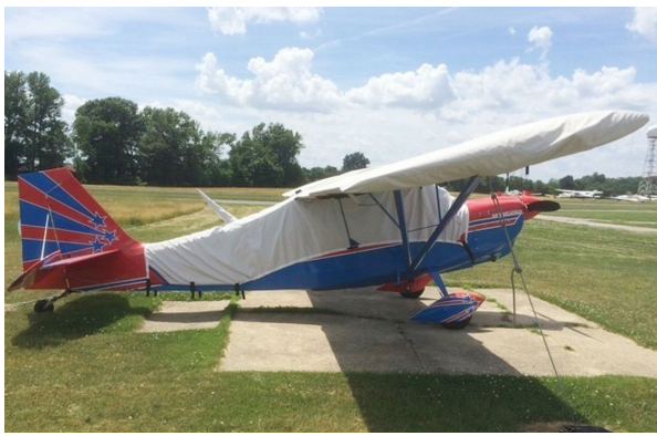
Bellanca Decathlon Canopy Cover (Over-Top, Extended to tail), Wing Covers.