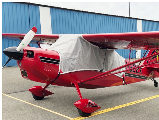
Bellanca Decathlon Travel Canopy Cover