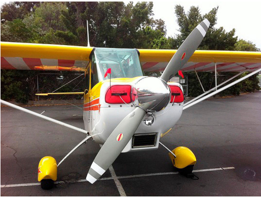
Bellanca Citabria Engine Plugs