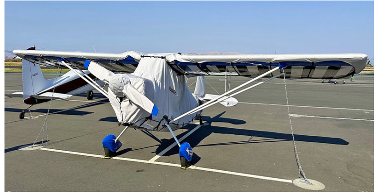
Bellanca Decathlon Cover Set