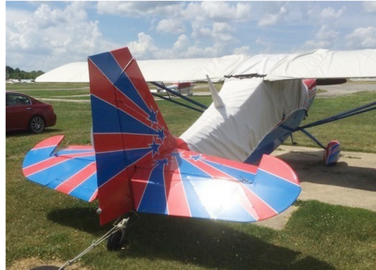
Bellanca Decathlon Canopy Cover (Over-Top, Extended to tail), Wing Covers.