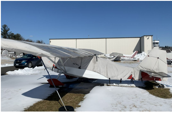
American Champion Decathlon Extended Canopy, Engine, Wing & Empennage Covers