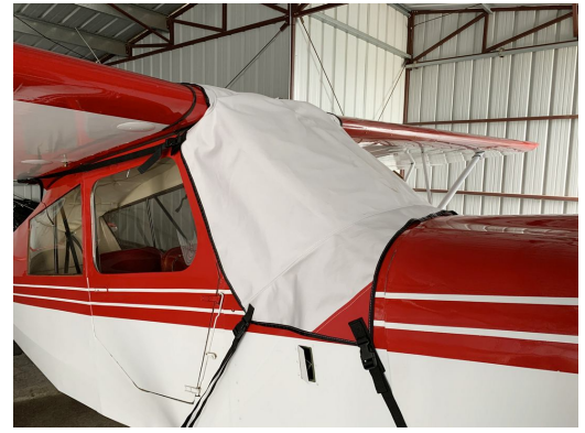
Bellanca Citabria Windshield/Skylight Cover