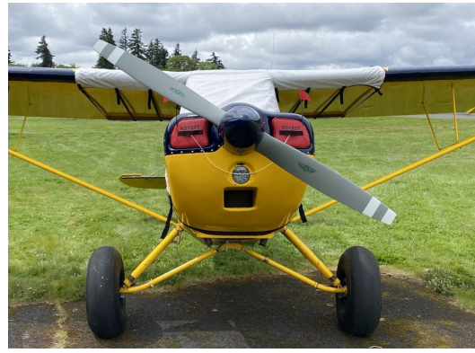
American Champion Citabria canopy cover over the top style, extends to cover gas caps, Engine Plugs