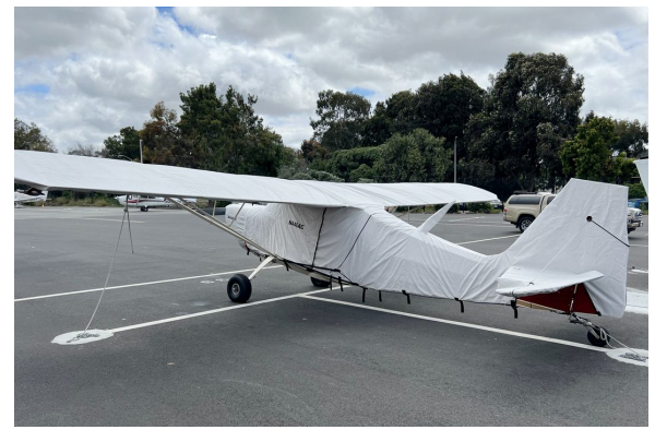
Bellanca Decathlon Full Cover Set