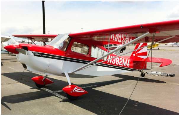
Bellanca Decathlon HeatShield Set

window framing. It folds up flat and easily stores in the included storage sleeve. Some designs may require velcro and suction cups or split right and left sides. A Heatshield is an excellent short-term remedy for cockpit overheating. An external fabric cover is far more effective and practical for long-term protection.