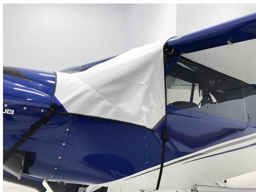
Cub Crafters CC-11 Windshield Cover

This cover type is made from Silver Acrylic Sunbrella canvas and is 100% lined with a soft and smooth microfiber. Bruce's Custom Covers developed this material combination especially for aircraft protection. The outer material is medium weight and treated for water resistance, UV resistance and anti-static buildup. The inner lining is a very soft and smooth microfiber to prevent scratching. The material is very reflective, and tests show that the cabin interior temperature can be reduced to near-ambient temperature on the hottest of days. It is water, ice and snow repellent, yet breathable to allow moisture to escape from between the cover and the aircraft surface.