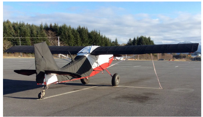
Bellanca Scout 8GCBC Canopy, Wing & Empennage Covers