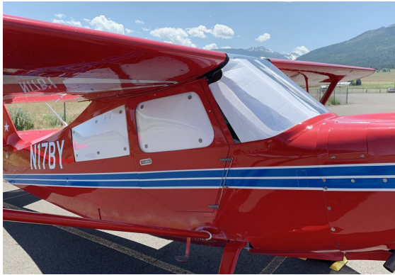
Bellanca Decathlon 8KCAB Heatshield Set with white side out