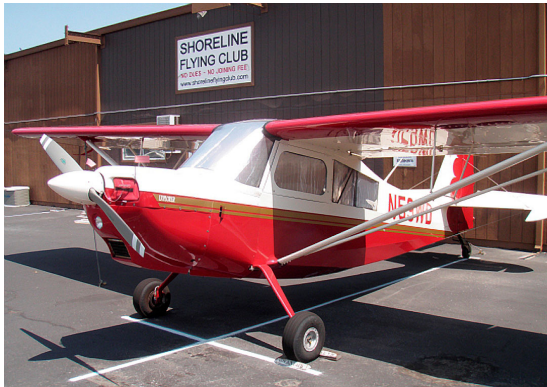
Bellanca Citabria Cabin HeatShield Set

Windshield Heatshields are interior sunshades for an aircraft's front windshield. The product is a unique composite of closed-cell foam with a silver mylar finish. The semi-rigid design is stiff enough to stand along the inside of the windshield using sun visors or window framing. It folds up flat and easily stores in the included storage sleeve. Some designs may require velcro and suction cups or split right and left sides. A Heatshield is an excellent short-term remedy for cockpit overheating. An external fabric cover is far more effective and practical for long-term protection.