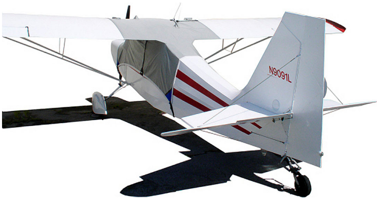
Bellanca Citabria Over-Top Canopy, extended to cover gas caps

This cover type is made from Silver Acrylic Sunbrella canvas and is 100% lined with a soft and smooth microfiber. Bruce's Custom Covers developed this material combination especially for aircraft protection. The outer material is medium weight and treated for water resistance, UV resistance and anti-static buildup. The inner lining is a very soft and smooth microfiber to prevent scratching. The material is very reflective, and tests show that the cabin interior temperature can be reduced to near-ambient temperature on the hottest of days. It is water, ice and snow repellent, yet breathable to allow moisture to escape from between the cover and the aircraft surface.