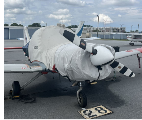
Scottish Aviation Bulldog Canopy & Engine Covers