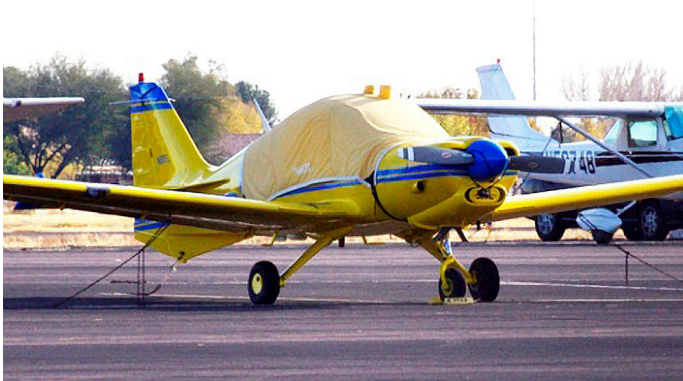
Beagle Pup Canopy Cover

This cover type is made from Silver Acrylic Sunbrella canvas and is 100% lined with a soft and smooth microfiber. Bruce's Custom Covers developed this material combination especially for aircraft protection. The outer material is medium weight and treated for water resistance, UV resistance and anti-static buildup. The inner lining is a very soft and smooth microfiber to prevent scratching. The material is very reflective, and tests show that the cabin interior temperature can be reduced to near-ambient temperature on the hottest of days. It is water, ice and snow repellent, yet breathable to allow moisture to escape from between the cover and the aircraft surface.