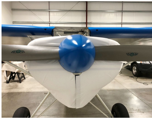
Bearhawk Patrol Engine Cover, test fit cover

This cover type is made from Silver Acrylic Sunbrella canvas and is 100% lined with a soft and smooth microfiber. Bruce's Custom Covers developed this material combination especially for aircraft protection. The outer material is medium weight and treated for water resistance, UV resistance and anti-static buildup. The inner lining is a very soft and smooth microfiber to prevent scratching. The material is very reflective, and tests show that the cabin interior temperature can be reduced to near-ambient temperature on the hottest of days. It is water, ice and snow repellent, yet breathable to allow moisture to escape from between the cover and the aircraft surface.