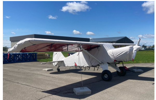
Bearhawk 4-Place Complete Cover Set, AFTER