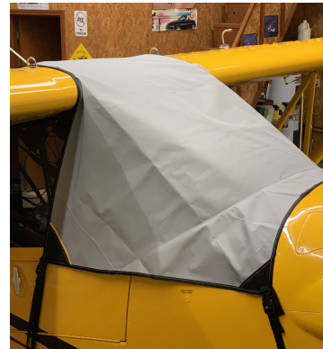
Cub Crafters Carbon Cub FX3 Windshield/Skylight Cover, travel weight