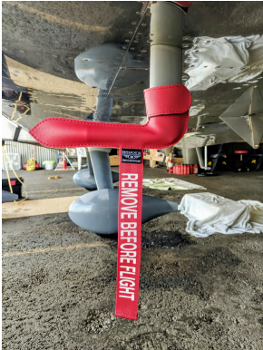
Van's RV-14 Pitot Cover

Engine Inlet Plugs are custom fit for your Bearhawk Patrol Model (2 Place) intakes, made with heavy-duty vinyl material, and stuffed with a single block of sculpted urethane foam. Each plug has a zipper that allows the foam to be removed and dried if necessary. Engine plugs have warning flags that are visible from the cockpit or 'remove before flight' streamers sewn onto the face of the plugs. Most plugs are imprinted with the aircraft registration number in black for an extra charge. Storage bag NOT included. Engine plugs may be inserted after flight when the engine is still warm. Engine Inlet Plugs are commonly referred to as Cowl Plugs, Intake Plugs, Cowl Blocks, Engine Blocks, and Engine Bungs.