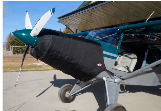
Bearhawk Insulated Engine Cover