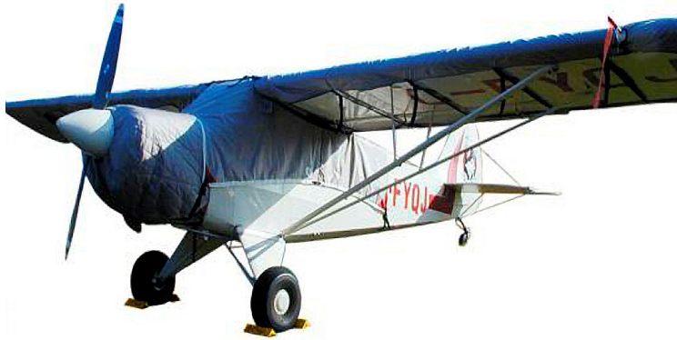
Aviat Husky Insulated Engine Cover, Canopy & Wing Covers

WINTER USE MATERIAL - Made with Solution-Dyed Polyester fabric, this option is intended for seasonal use to aid in deicing, rain mitigation, or for occasional travel. The material is lighter and more compact, but more susceptible to UV damage and may have a shorter useful life if used continuously outside than the all-year use material.