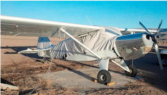
Bearhawk Canopy & Empennage Cover

This cover type is made from Silver Acrylic Sunbrella canvas and is 100% lined with a soft and smooth microfiber. Bruce's Custom Covers developed this material combination especially for aircraft protection. The outer material is medium weight and treated for water resistance, UV resistance and anti-static buildup. The inner lining is a very soft and smooth microfiber to prevent scratching. The material is very reflective, and tests show that the cabin interior temperature can be reduced to near-ambient temperature on the hottest of days. It is water, ice and snow repellent, yet breathable to allow moisture to escape from between the cover and the aircraft surface.