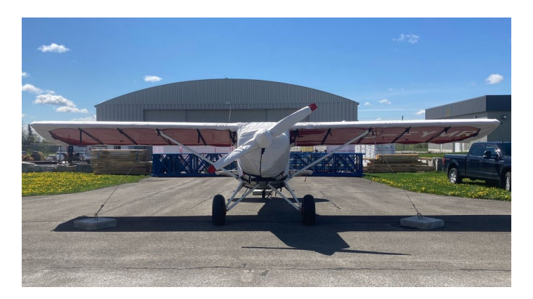
Bearhawk 4-Place Complete Cover Set