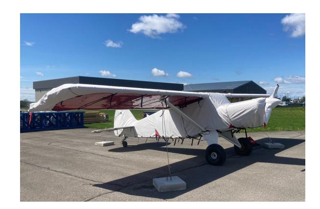
Bearhawk 4-Place Complete Cover Set, AFTER

This cover type is made from Silver Acrylic Sunbrella canvas and is 100% lined with a soft and smooth microfiber. Bruce's Custom Covers developed this material combination especially for aircraft protection. The outer material is medium weight and treated for water resistance, UV resistance and anti-static buildup. The inner lining is a very soft and smooth microfiber to prevent scratching. The material is very reflective, and tests show that the cabin interior temperature can be reduced to near-ambient temperature on the hottest of days. It is water, ice and snow repellent, yet breathable to allow moisture to escape from between the cover and the aircraft surface.