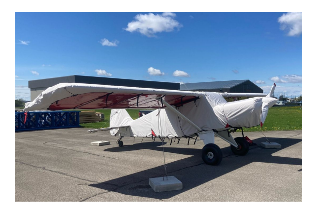
Bearhawk 4-Place Complete Cover Set, AFTER

This cover type is made from Silver Acrylic Sunbrella canvas and is 100% lined with a soft and smooth microfiber. Bruce's Custom Covers developed this material combination especially for aircraft protection. The outer material is medium weight and treated for water resistance, UV resistance and anti-static buildup. The inner lining is a very soft and smooth microfiber to prevent scratching. The material is very reflective, and tests show that the cabin interior temperature can be reduced to near-ambient temperature on the hottest of days. It is water, ice and snow repellent, yet breathable to allow moisture to escape from between the cover and the aircraft surface.