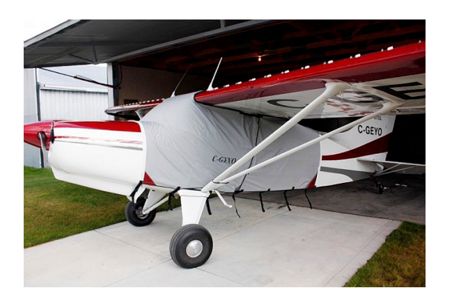
Maule Over-Top Extended Canopy Cover