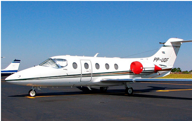
Beechjet 400 Engine Covers & Cockpit HeatShields

The Hawker Beechcraft Beechjet 400, Hawker 400XP (T1A, T400 Jayhawk) Intake Covers are designed to install easily yet be completely storable. A spring steel hoop is sewn into the hem of each cover, allowing them to be installed without climbing onto the wing or using a stepladder. To store the covers the spring steel hoop folds like a band-saw blade into three nesting rings. Each cover folds into a compact circular bundle which is stored in the included duffle bag, yet they unfold quickly for use. The Tri-Fold Ring cover is made of medium weight nylon which is available in a variety of colors to match the paint trim. Each cover set comes complete with installation and folding instructions. The aircraft's registration number can be silkscreened onto the cover for an extra charge.