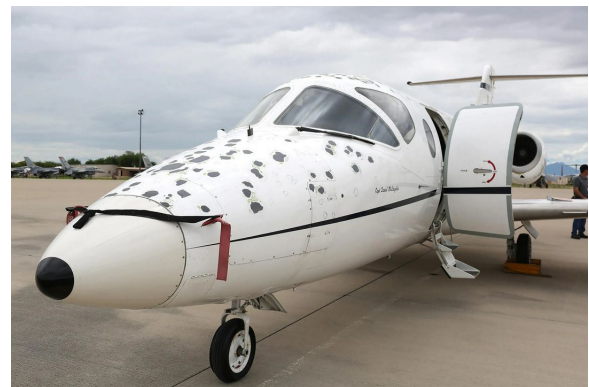
Jayhawk Hail Damage