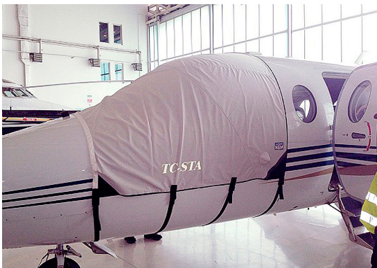
Beechjet 400A Cockpit Cover

This cover type is made from Silver Acrylic Sunbrella canvas and is 100% lined with a soft and smooth microfiber. Bruce's Custom Covers developed this material combination especially for aircraft protection. The outer material is medium weight and treated for water resistance, UV resistance and anti-static buildup. The inner lining is a very soft and smooth microfiber to prevent scratching. The material is very reflective, and tests show that the cabin interior temperature can be reduced to near-ambient temperature on the hottest of days. It is water, ice and snow repellent, yet breathable to allow moisture to escape from between the cover and the aircraft surface.