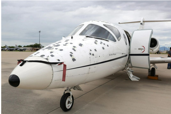
Jayhawk Hail Damage

This cover type is made from Silver Acrylic Sunbrella canvas and is 100% lined with a soft and smooth microfiber. Bruce's Custom Covers developed this material combination especially for aircraft protection. The outer material is medium weight and treated for water resistance, UV resistance and anti-static buildup. The inner lining is a very soft and smooth microfiber to prevent scratching. The material is very reflective, and tests show that the cabin interior temperature can be reduced to near-ambient temperature on the hottest of days. It is water, ice and snow repellent, yet breathable to allow moisture to escape from between the cover and the aircraft surface.