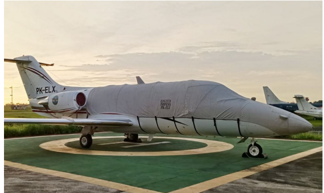
Beechjet Fuselage/Nose Cover