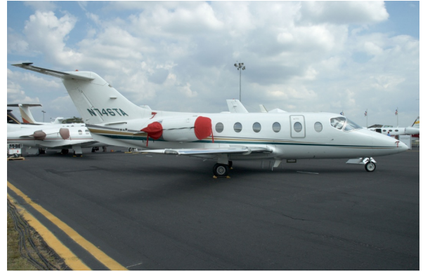
Beechjet 400 Engine Covers