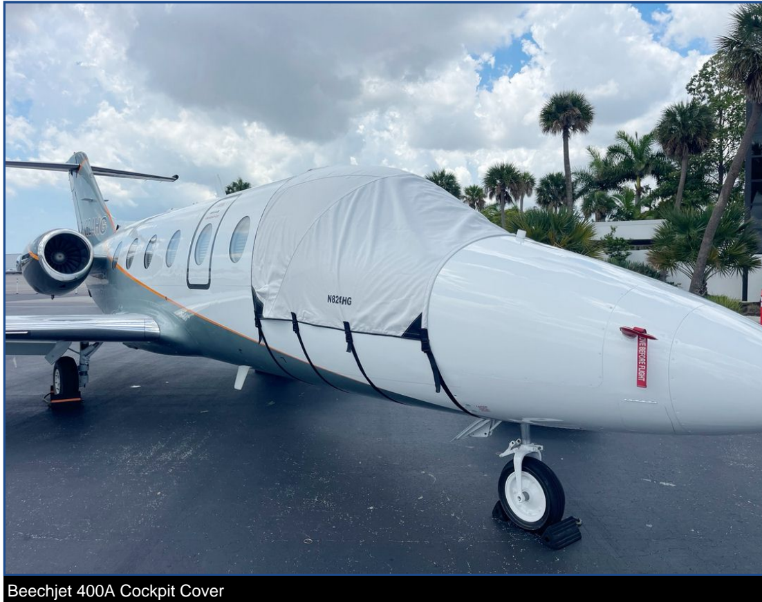
Beechjet 400A Cockpit Cover