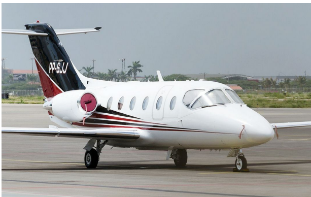
Beechjet Engine Plugs and Cockpit Heatshields

Cockpit Heatshields are interior sunshades for the aircraft's cockpit. The product is a unique composite of closed-cell foam with a silver mylar finish. The semi-rigid design is stiff enough to stand inside the window framing. The set folds up flat and is easily stored in the included storage sleeve. Some designs may require velcro and suction cups. Our Heatshields for jets are offered white side out because some aircraft manufacturers have issued advisories against reflective window inserts due to potential heat damage. A Heatshield is an excellent short-term remedy for cockpit overheating, but an external fabric cover is more effective for long-term protection.