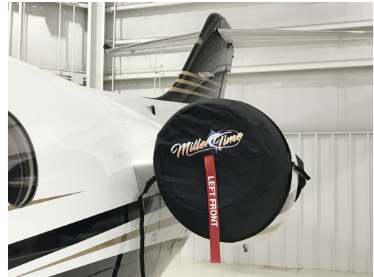
Raytheon 400A Engine Covers