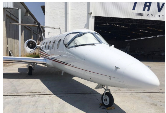
Beechjet Cockpit Heatshields