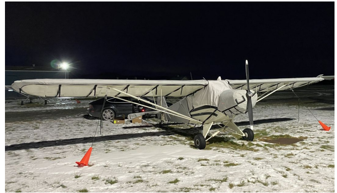
PA-18 Super Cub Winter Cover Set