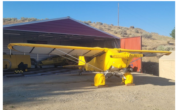
Piper PA-18 All Weather Cover Set