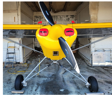
Preceptor STOL King Engine Plugs