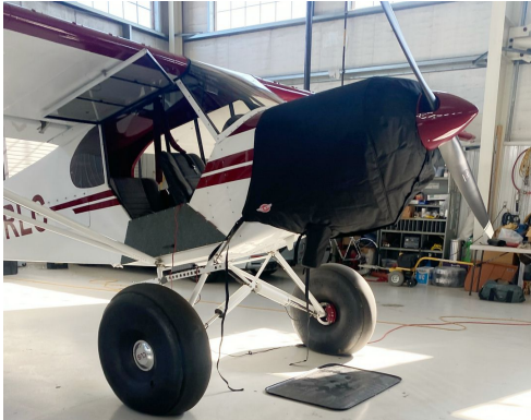
Piper PA-18 Super Cub Insulated Engine Cover

This cover type is made from Silver Acrylic Sunbrella canvas and is 100% lined with a soft and smooth microfiber. Bruce's Custom Covers developed this material combination especially for aircraft protection. The outer material is medium weight and treated for water resistance, UV resistance and anti-static buildup. The inner lining is a very soft and smooth microfiber to prevent scratching. The material is very reflective, and tests show that the cabin interior temperature can be reduced to near-ambient temperature on the hottest of days. It is water, ice and snow repellent, yet breathable to allow moisture to escape from between the cover and the aircraft surface.