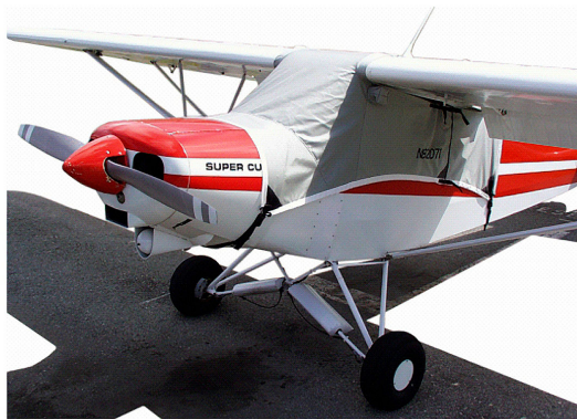
Piper PA-18 Super Cub Canopy Cover

This cover type is made from Silver Acrylic Sunbrella canvas and is 100% lined with a soft and smooth microfiber. Bruce's Custom Covers developed this material combination especially for aircraft protection. The outer material is medium weight and treated for water resistance, UV resistance and anti-static buildup. The inner lining is a very soft and smooth microfiber to prevent scratching. The material is very reflective, and tests show that the cabin interior temperature can be reduced to near-ambient temperature on the hottest of days. It is water, ice and snow repellent, yet breathable to allow moisture to escape from between the cover and the aircraft surface.