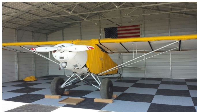
Bellanca Citabria Over-the-Top Canopy Cover, extended to cover gas caps Piper PA-18 Super Cub Extended Canopy & Wing Covers caps