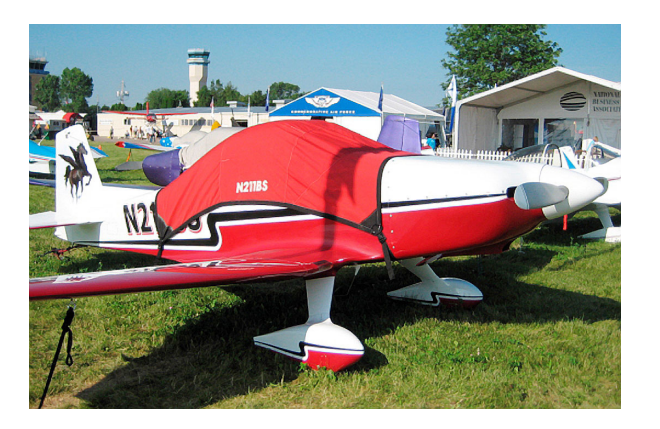
Bushby Mustang Canopy Cover