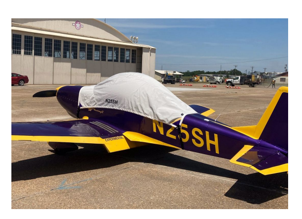
Mustang II Canopy Cover