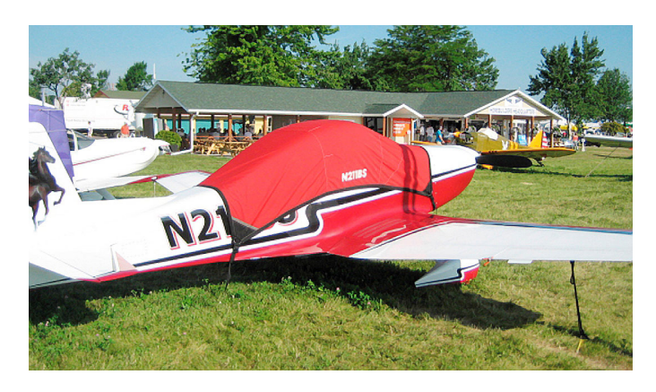
Bushby Mustang Canopy Cover

Travel Covers are made with Silver Solution-Dyed Polyester fabric and only lined over the windshield to save weight. The material is lightweight and more compact for easy stowage in the aircraft. The polyester material is water resistant, but only intended for occasional use outside. We also have an ultra lightweight material available for fitted hangar dust covers. For daily outdoor use, the non-travel Sunbrella Cover is the best choice.