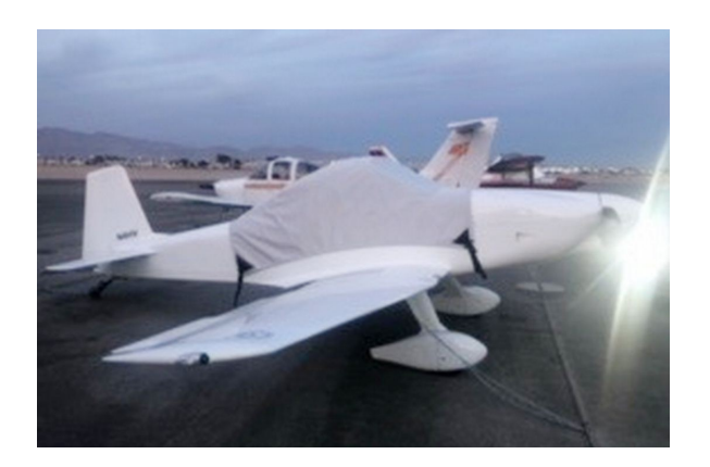
Thorp T-18 Canopy Cover

This cover type is made from Silver Acrylic Sunbrella canvas and is 100% lined with a soft and smooth microfiber. Bruce's Custom Covers developed this material combination especially for aircraft protection. The outer material is medium weight and treated for water resistance, UV resistance and anti-static buildup. The inner lining is a very soft and smooth microfiber to prevent scratching. The material is very reflective, and tests show that the cabin interior temperature can be reduced to near-ambient temperature on the hottest of days. It is water, ice and snow repellent, yet breathable to allow moisture to escape from between the cover and the aircraft surface.