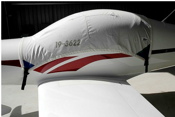
Pulsar Canopy Cover

This cover type is made from Silver Acrylic Sunbrella canvas and is 100% lined with a soft and smooth microfiber. Bruce's Custom Covers developed this material combination especially for aircraft protection. The outer material is medium weight and treated for water resistance, UV resistance and anti-static buildup. The inner lining is a very soft and smooth microfiber to prevent scratching. The material is very reflective, and tests show that the cabin interior temperature can be reduced to near-ambient temperature on the hottest of days. It is water, ice and snow repellent, yet breathable to allow moisture to escape from between the cover and the aircraft surface.