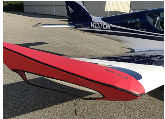
BRM Aero Bristell S-LSA Wingtip Pads