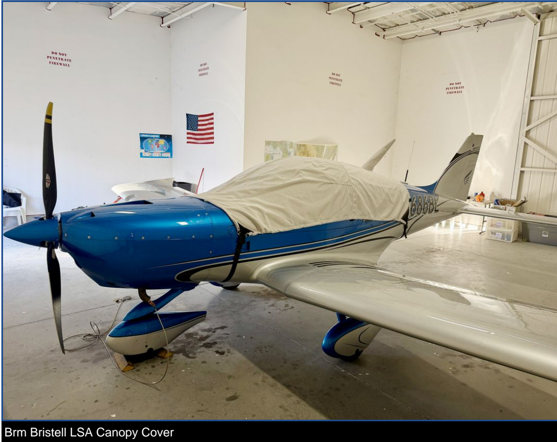
Brm Bristell LSA Canopy Cover