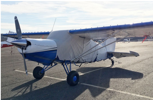
Maule M-5-235C Extended Canopy Cover, Empennage Cover

This cover type is made from Silver Acrylic Sunbrella canvas and is 100% lined with a soft and smooth microfiber. Bruce's Custom Covers developed this material combination especially for aircraft protection. The outer material is medium weight and treated for water resistance, UV resistance and anti-static buildup. The inner lining is a very soft and smooth microfiber to prevent scratching. The material is very reflective, and tests show that the cabin interior temperature can be reduced to near-ambient temperature on the hottest of days. It is water, ice and snow repellent, yet breathable to allow moisture to escape from between the cover and the aircraft surface.