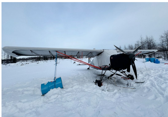
Bushmaster Wing, Canopy & Insulated Engine Covers

WINTER USE MATERIAL - Made with Solution-Dyed Polyester fabric, this option is intended for seasonal use to aid in deicing, rain mitigation, or for occasional travel. The material is lighter and more compact, but more susceptible to UV damage and may have a shorter useful life if used continuously outside than the all-year use material.