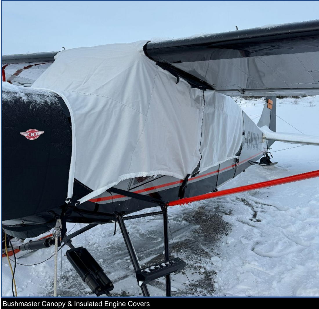
Bushmaster Canopy &amp; Insulated Engine Covers