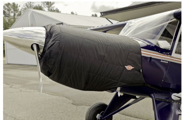
Bearhawk Insulated Engine Cover