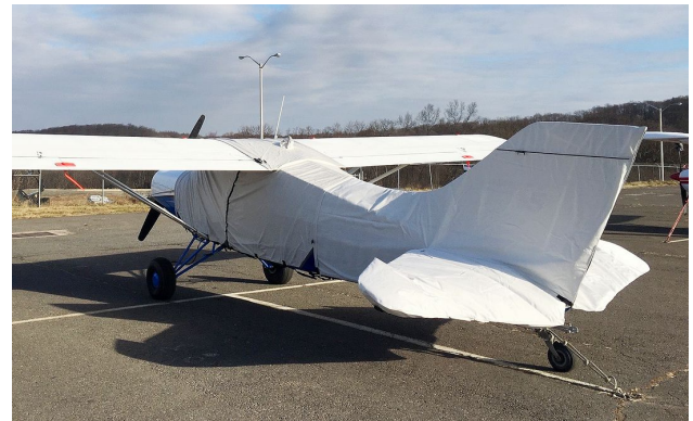
Maule M-5-235C Extended Canopy Cover, Empennage Cover