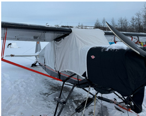
Bushmaster Canopy & Insulated Engine Covers