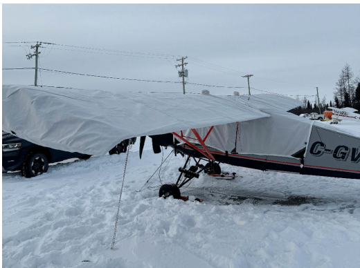
Bushmaster Wing Covers, Canopy Cover

WINTER USE MATERIAL - Made with Solution-Dyed Polyester fabric, this option is intended for seasonal use to aid in deicing, rain mitigation, or for occasional travel. The material is lighter and more compact, but more susceptible to UV damage and may have a shorter useful life if used continuously outside than the all-year use material.