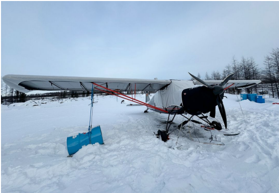
Bushmaster Wing, Canopy & Insulated Engine Covers