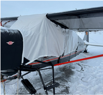
Bushmaster Canopy & Insulated Engine Covers

This cover type is made from Silver Acrylic Sunbrella canvas and is 100% lined with a soft and smooth microfiber. Bruce's Custom Covers developed this material combination especially for aircraft protection. The outer material is medium weight and treated for water resistance, UV resistance and anti-static buildup. The inner lining is a very soft and smooth microfiber to prevent scratching. The material is very reflective, and tests show that the cabin interior temperature can be reduced to near-ambient temperature on the hottest of days. It is water, ice and snow repellent, yet breathable to allow moisture to escape from between the cover and the aircraft surface.