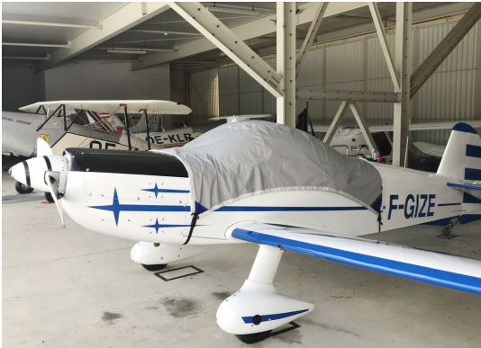
Mudry Cap 10 Travel Cover, Light Weight Travel Canopy Cover

Travel Covers are made with Silver Solution-Dyed Polyester fabric and only lined over the windshield to save weight. The material is lightweight and more compact for easy stowage in the aircraft. The polyester material is water resistant, but only intended for occasional use outside. We also have an ultra lightweight material available for fitted hangar dust covers. For daily outdoor use, the non-travel Sunbrella Cover is the best choice.