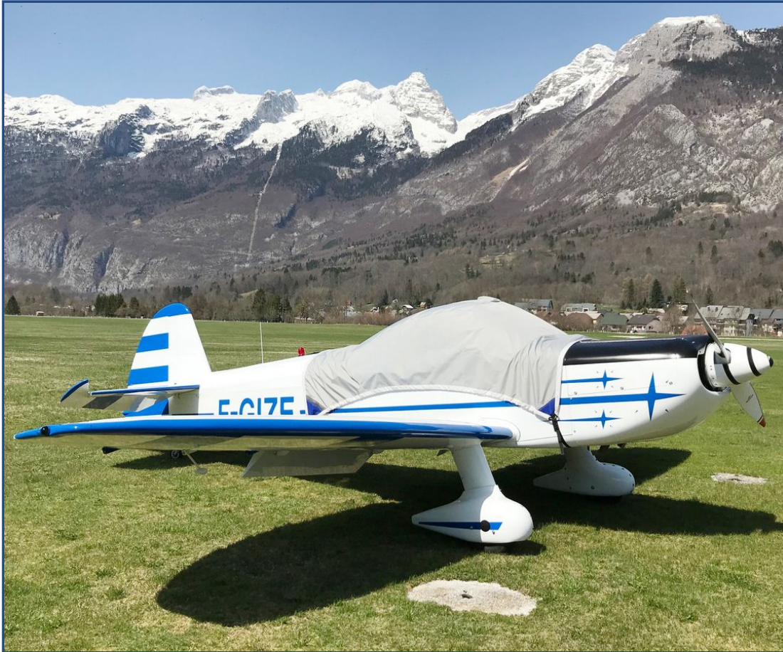
Mudry Cap 10 Canopy Cover