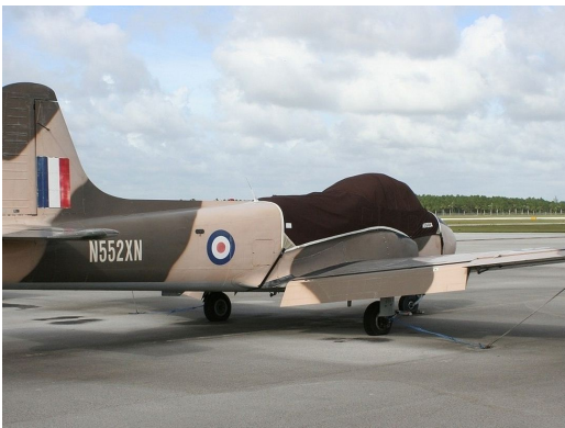
Jet Provost Canopy Cover