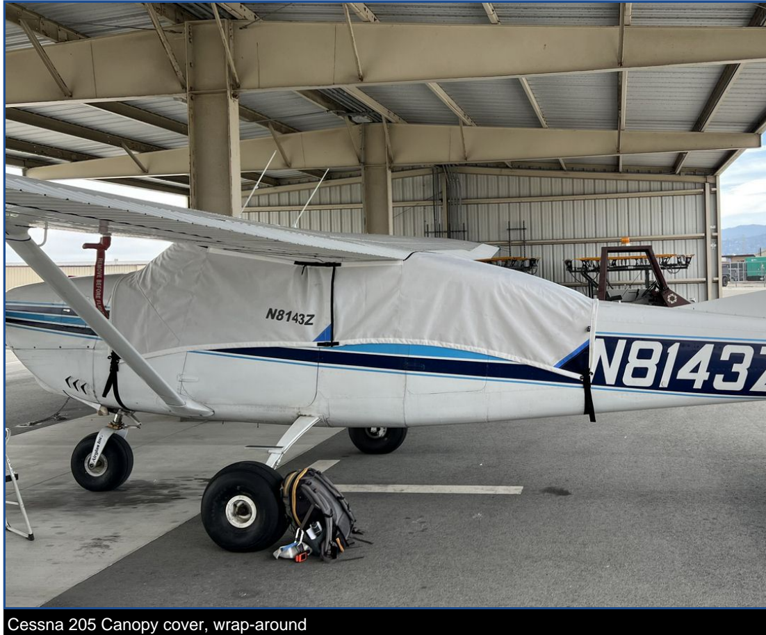
Cessna 205 Canopy cover, wrap-around