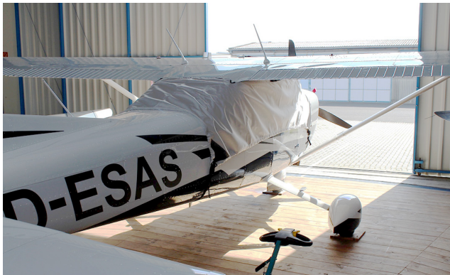
Cessna 206 Stationair Canopy Cover, Wrap-Around

This cover type is made from Silver Acrylic Sunbrella canvas and is 100% lined with a soft and smooth microfiber. Bruce's Custom Covers developed this material combination especially for aircraft protection. The outer material is medium weight and treated for water resistance, UV resistance and anti-static buildup. The inner lining is a very soft and smooth microfiber to prevent scratching. The material is very reflective, and tests show that the cabin interior temperature can be reduced to near-ambient temperature on the hottest of days. It is water, ice and snow repellent, yet breathable to allow moisture to escape from between the cover and the aircraft surface.