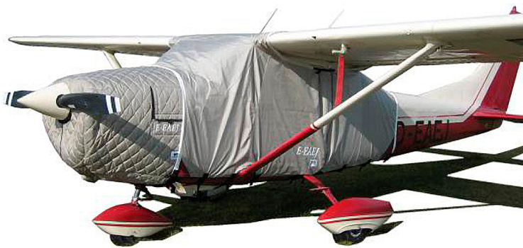
Cessna 182 Insulated Engine Cover ext. to l.e of nose gear, Extended Canopy Cover

This cover type is made from Silver Acrylic Sunbrella canvas and is 100% lined with a soft and smooth microfiber. Bruce's Custom Covers developed this material combination especially for aircraft protection. The outer material is medium weight and treated for water resistance, UV resistance and anti-static buildup. The inner lining is a very soft and smooth microfiber to prevent scratching. The material is very reflective, and tests show that the cabin interior temperature can be reduced to near-ambient temperature on the hottest of days. It is water, ice and snow repellent, yet breathable to allow moisture to escape from between the cover and the aircraft surface.