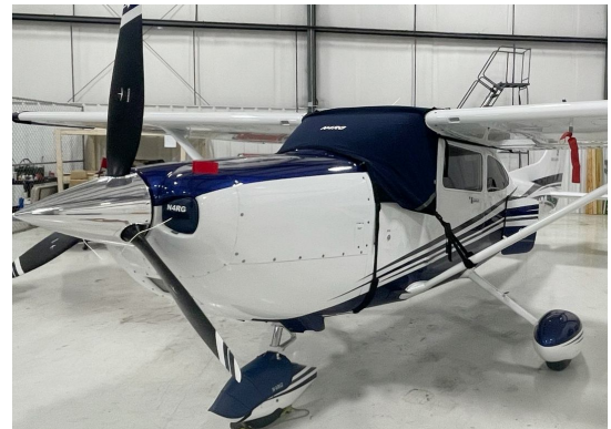
Cessna 182 Windshield Cover, Engine Plugs