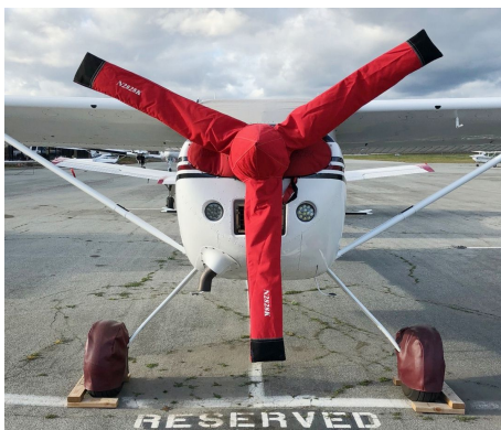
Cessna Skywagon Propellor/Spinner Cover, 3-blade type

This cover type is made from Silver Acrylic Sunbrella canvas and is 100% lined with a soft and smooth microfiber. Bruce's Custom Covers developed this material combination especially for aircraft protection. The outer material is medium weight and treated for water resistance, UV resistance and anti-static buildup. The inner lining is a very soft and smooth microfiber to prevent scratching. The material is very reflective, and tests show that the cabin interior temperature can be reduced to near-ambient temperature on the hottest of days. It is water, ice and snow repellent, yet breathable to allow moisture to escape from between the cover and the aircraft surface.