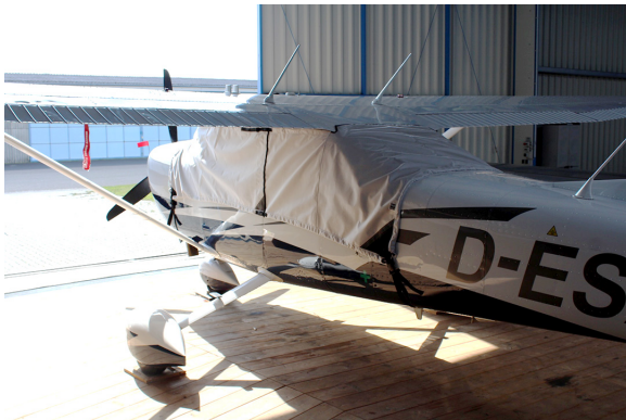
Cessna 206 Stationair Canopy Cover, Wrap-Around

This cover type is made from Silver Acrylic Sunbrella canvas and is 100% lined with a soft and smooth microfiber. Bruce's Custom Covers developed this material combination especially for aircraft protection. The outer material is medium weight and treated for water resistance, UV resistance and anti-static buildup. The inner lining is a very soft and smooth microfiber to prevent scratching. The material is very reflective, and tests show that the cabin interior temperature can be reduced to near-ambient temperature on the hottest of days. It is water, ice and snow repellent, yet breathable to allow moisture to escape from between the cover and the aircraft surface.