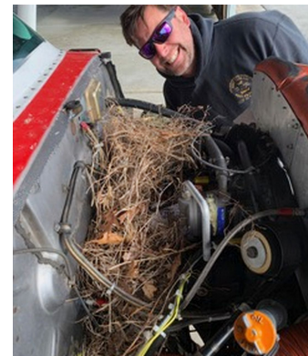
Cessna 172 Bird Nest Problem