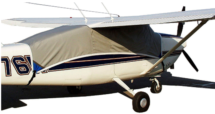
Cessna 206 Wrap-Around Canopy Cover