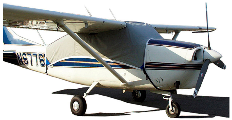
Canopy covers are available in belly strap, snap-on or Over-the-Top Styles