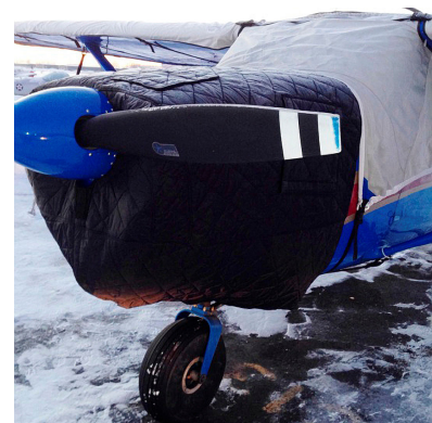
Cessna 205 Insulated Engine Cover