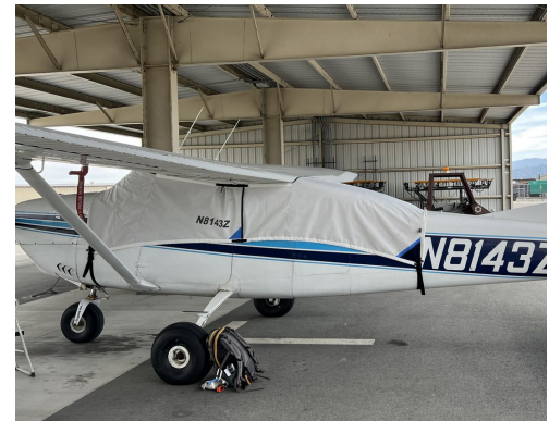
Cessna 205 Canopy cover, wrap-around