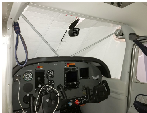
Cessna 180 Skywagon Windshield Heatshield, (W/ Compass)