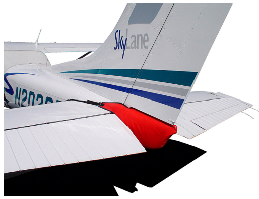
Cessna 182 Tailcone Cover