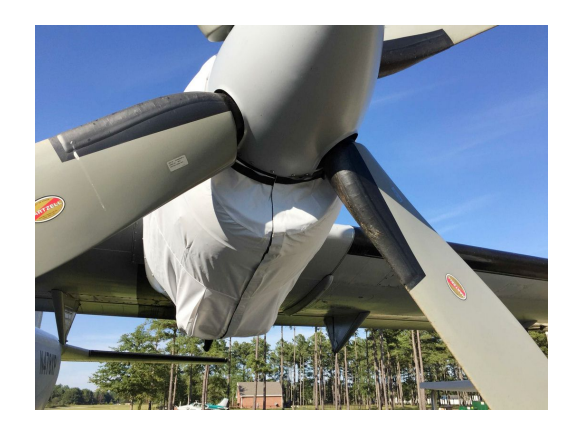
Casa 212 Engine Cover, test fit cover

This cover type is made from Silver Acrylic Sunbrella canvas and is 100% lined with a soft and smooth microfiber. Bruce's Custom Covers developed this material combination especially for aircraft protection. The outer material is medium weight and treated for water resistance, UV resistance and anti-static buildup. The inner lining is a very soft and smooth microfiber to prevent scratching. The material is very reflective, and tests show that the cabin interior temperature can be reduced to near-ambient temperature on the hottest of days. It is water, ice and snow repellent, yet breathable to allow moisture to escape from between the cover and the aircraft surface.