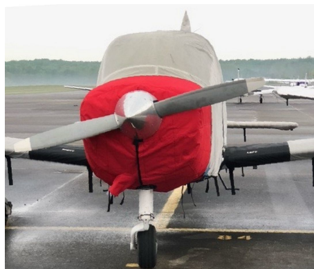
Beech Sierra Insulated Engine Cover

This cover type is made from Silver Acrylic Sunbrella canvas and is 100% lined with a soft and smooth microfiber. Bruce's Custom Covers developed this material combination especially for aircraft protection. The outer material is medium weight and treated for water resistance, UV resistance and anti-static buildup. The inner lining is a very soft and smooth microfiber to prevent scratching. The material is very reflective, and tests show that the cabin interior temperature can be reduced to near-ambient temperature on the hottest of days. It is water, ice and snow repellent, yet breathable to allow moisture to escape from between the cover and the aircraft surface.