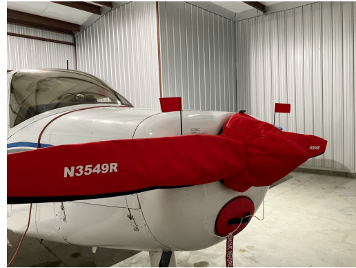
Beech A23 Musketeer Insulated Prop Cover, Engine Plugs