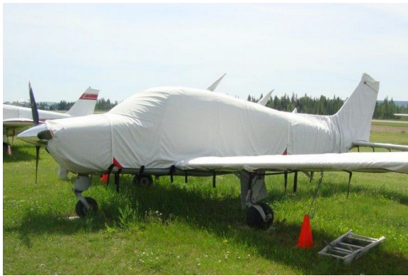
Beech Sierra Engine, Extended Canopy, Empennage, & Wing Covers

WINTER USE MATERIAL - Made with Solution-Dyed Polyester fabric, this option is intended for seasonal use to aid in deicing, rain mitigation, or for occasional travel. The material is lighter and more compact, but more susceptible to UV damage and may have a shorter useful life if used continuously outside than the all-year use material.