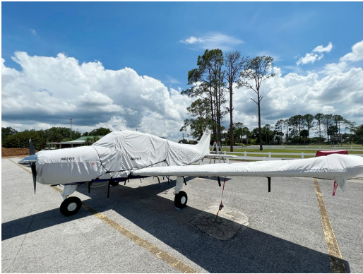
Beech Musketeer A23 Cover Set

This cover type is made from Silver Acrylic Sunbrella canvas and is 100% lined with a soft and smooth microfiber. Bruce's Custom Covers developed this material combination especially for aircraft protection. The outer material is medium weight and treated for water resistance, UV resistance and anti-static buildup. The inner lining is a very soft and smooth microfiber to prevent scratching. The material is very reflective, and tests show that the cabin interior temperature can be reduced to near-ambient temperature on the hottest of days. It is water, ice and snow repellent, yet breathable to allow moisture to escape from between the cover and the aircraft surface.