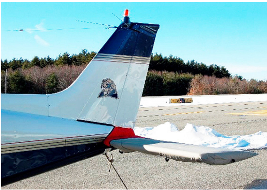
Tailcone & Horizontal Stabilizer Covers

WINTER USE MATERIAL - Made with Solution-Dyed Polyester fabric, this option is intended for seasonal use to aid in deicing, rain mitigation, or for occasional travel. The material is lighter and more compact, but more susceptible to UV damage and may have a shorter useful life if used continuously outside than the all-year use material.