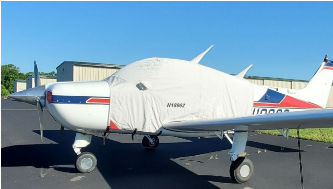
Beech C23 Sundowner Extended Canopy Cover

This cover type is made from Silver Acrylic Sunbrella canvas and is 100% lined with a soft and smooth microfiber. Bruce's Custom Covers developed this material combination especially for aircraft protection. The outer material is medium weight and treated for water resistance, UV resistance and anti-static buildup. The inner lining is a very soft and smooth microfiber to prevent scratching. The material is very reflective, and tests show that the cabin interior temperature can be reduced to near-ambient temperature on the hottest of days. It is water, ice and snow repellent, yet breathable to allow moisture to escape from between the cover and the aircraft surface.