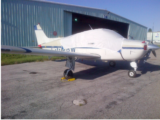
Beech Sierra Canopy Cover, Engine Plugs, Tailcone Cover

plugs have warning flags that are visible from the cockpit or 'remove before flight' streamers sewn onto the face of the plugs. Most plugs are imprinted with the aircraft registration number in black for an extra charge. Storage bag NOT included. Engine plugs may be inserted after flight when the engine is still warm. Engine Inlet Plugs are commonly referred to as Cowl Plugs, Intake Plugs, Cowl Blocks, Engine Blocks, and Engine Bungs.