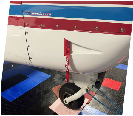
Beech Sundowner C23 Fresh Air Exhaust Plug (Pilot Side Of Fuselage)

plugs have warning flags that are visible from the cockpit or 'remove before flight' streamers sewn onto the face of the plugs. Most plugs are imprinted with the aircraft registration number in black for an extra charge. Storage bag NOT included. Engine plugs may be inserted after flight when the engine is still warm. Engine Inlet Plugs are commonly referred to as Cowl Plugs, Intake Plugs, Cowl Blocks, Engine Blocks, and Engine Bungs.