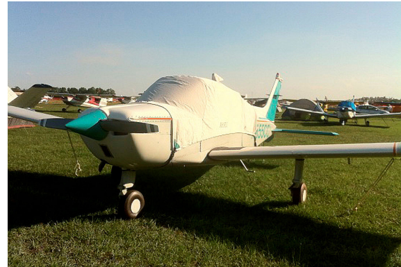
Beech C23 Sundowner Canopy Cover