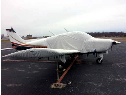
Beech Sundowner Extended Canopy Cover, Engine, and Wing Covers

This cover type is made from Silver Acrylic Sunbrella canvas and is 100% lined with a soft and smooth microfiber. Bruce's Custom Covers developed this material combination especially for aircraft protection. The outer material is medium weight and treated for water resistance, UV resistance and anti-static buildup. The inner lining is a very soft and smooth microfiber to prevent scratching. The material is very reflective, and tests show that the cabin interior temperature can be reduced to near-ambient temperature on the hottest of days. It is water, ice and snow repellent, yet breathable to allow moisture to escape from between the cover and the aircraft surface.