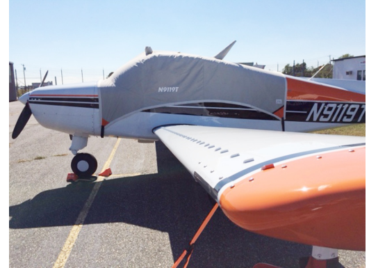
Beech Musketeer Canopy Cover