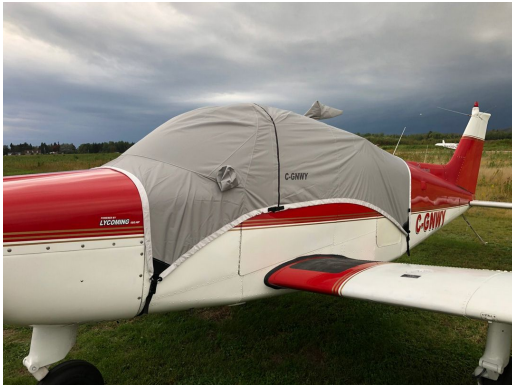
Beech Sundowner Travel Canopy Cover

Travel Covers are made with Silver Solution-Dyed Polyester fabric and only lined over the windshield to save weight. The material is lightweight and more compact for easy stowage in the aircraft. The polyester material is water resistant, but only intended for occasional use outside. We also have an ultra lightweight material available for fitted hangar dust covers. For daily outdoor use, the non-travel Sunbrella Cover is the best choice.