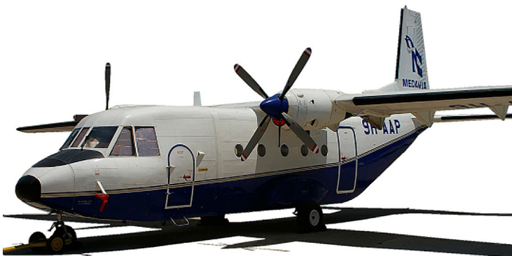
Casa 212 Engine Plugs

Engine Inlet Plugs are custom fit for your Casa/IPTN CN-235 intakes, made with heavy-duty vinyl material, and stuffed with a single block of sculpted urethane foam. Each plug has a zipper that allows the foam to be removed and dried if necessary. Engine plugs have warning flags that are visible from the cockpit or 'remove before flight' streamers sewn onto the face of the plugs. Most plugs are imprinted with the aircraft registration number in black for an extra charge. Storage bag NOT included. Engine plugs may be inserted after flight when the engine is still warm. Engine Inlet Plugs are commonly referred to as Cowl Plugs, Intake Plugs, Cowl Blocks, Engine Blocks, and Engine Bungs.