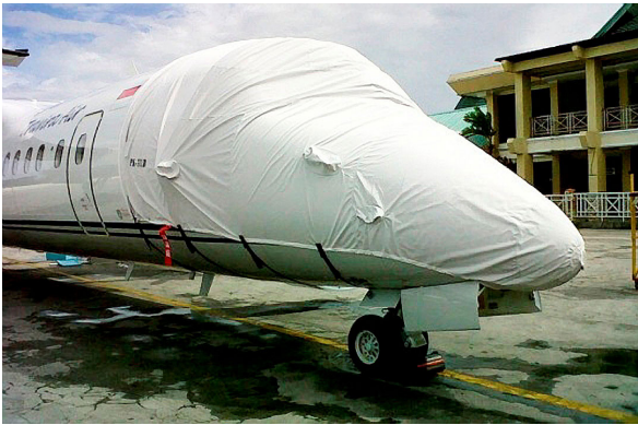
De Havilland Dash 8 Cockpit/Nose Cover