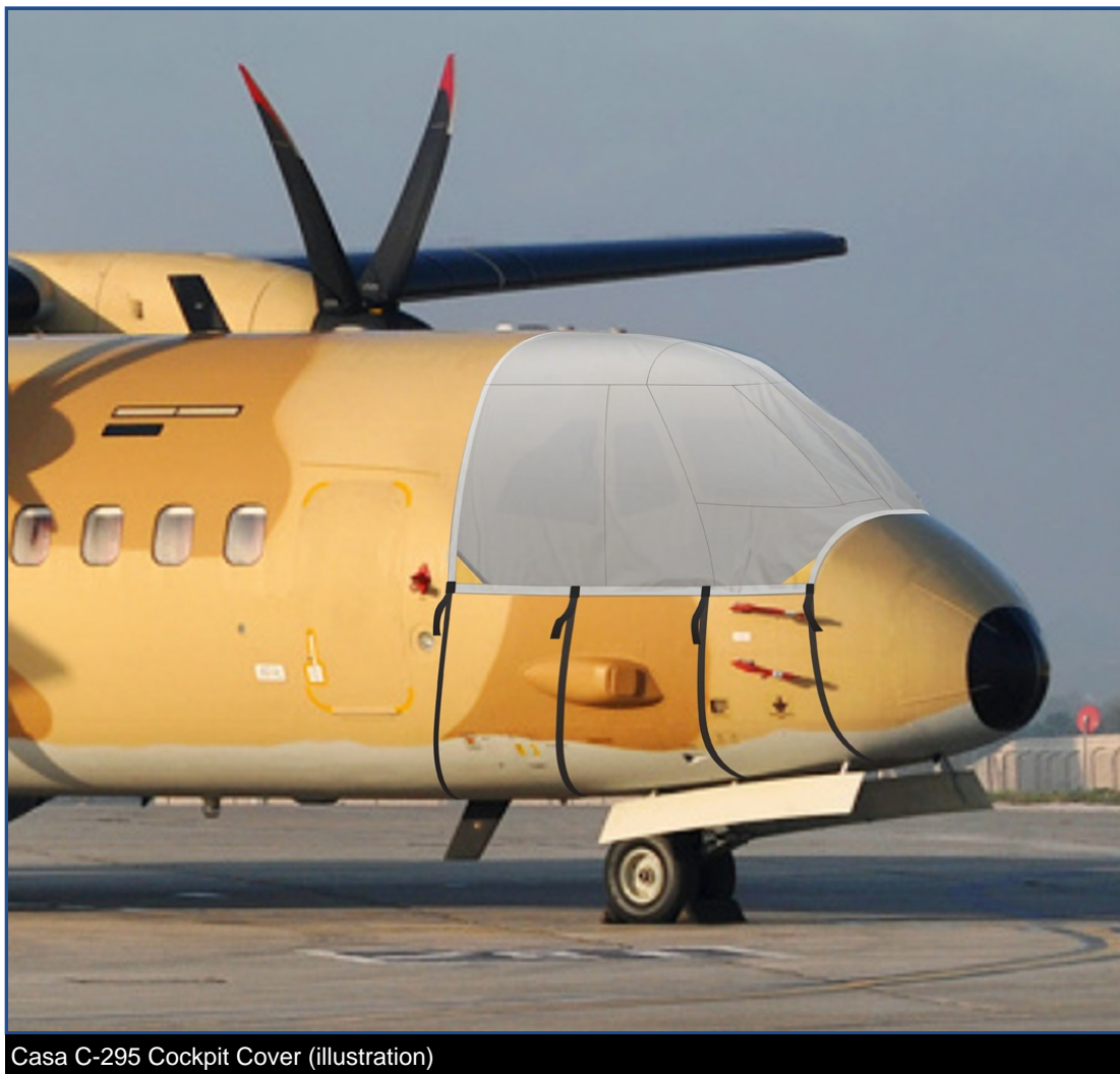
Casa C-295 Cockpit Cover (illustration)