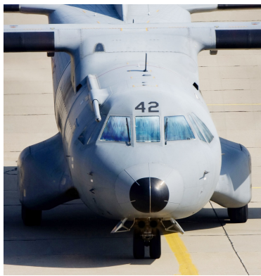
Casa C-295 Cockpit HeatShields (illustration)