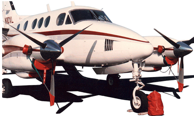
Pitot, Exhaust Covers, Engine Plugs & Prop Ties

Engine Inlet Plugs are custom fit for your Casa EADS C-295 intakes, made with heavy-duty vinyl material, and stuffed with a single block of sculpted urethane foam. Each plug has a zipper that allows the foam to be removed and dried if necessary. Engine plugs have warning flags that are visible from the cockpit or 'remove before flight' streamers sewn onto the face of the plugs. Most plugs are imprinted with the aircraft registration number in black for an extra charge. Storage bag NOT included. Engine plugs may be inserted after flight when the engine is still warm. Engine Inlet Plugs are commonly referred to as Cowl Plugs, Intake Plugs, Cowl Blocks, Engine Blocks, and Engine Bungs.