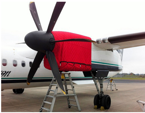
Dash 8-Q400 Insulated Engine Cover