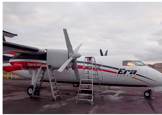
Dash 8 Insulated Engine & Prop Covers