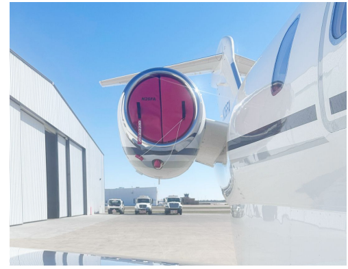
Canadair Challenger 300 Intake Plugs