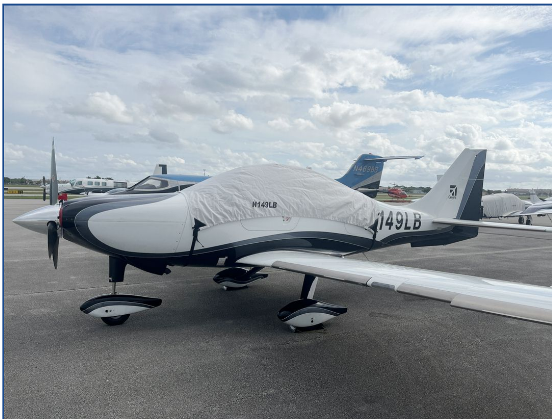
Cessna Corvalis Canopy Cover