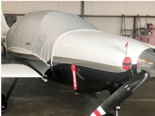
Columbia 350 Travel Cover, Engine Plugs

Travel Covers are made with Silver Solution-Dyed Polyester fabric and only lined over the windshield to save weight. The material is lightweight and more compact for easy stowage in the aircraft. The polyester material is water resistant, but only intended for occasional use outside. We also have an ultra lightweight material available for fitted hangar dust covers. For daily outdoor use, the non-travel Sunbrella Cover is the best choice.