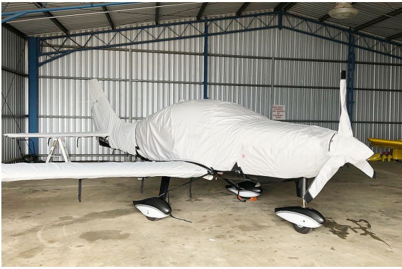
Columbia 350 Full Cover Set