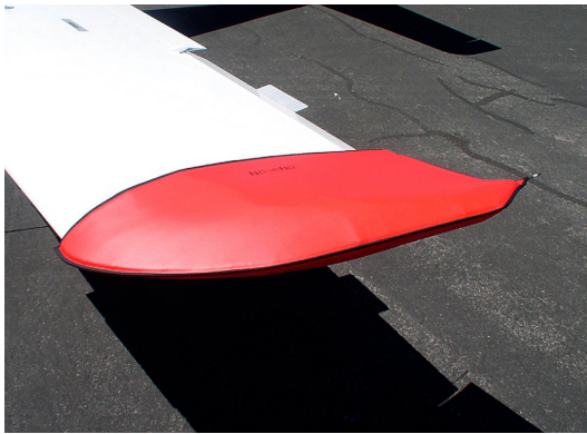
Cessna 350/400 Wingtip Pads

Designed to prevent damage to the aircraft extremities in crowded hangars, these products are made of bright red Naugahyde and thickly padded with a sandwich of closed cell foam.