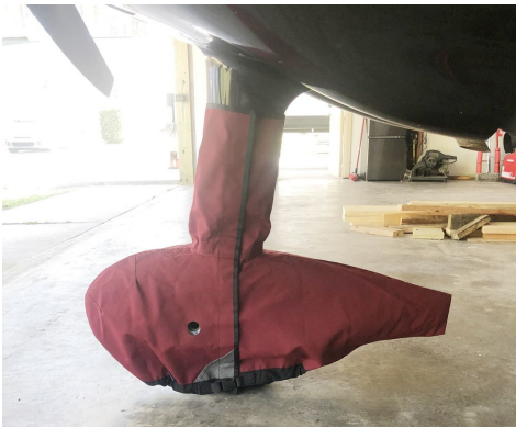
Cessna Corvalis, Lancair Columbia Wheelpant & Strut Cover