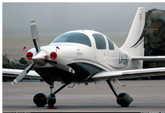
Cessna Corvalis Engine Plugs