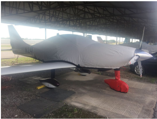
Lancair Columbia Extended Canopy/Engine Cover, Nose Wheelpant Cover

protection and cover longevity. This heavier more durable material is intended for all weather conditions, such as rain and snow or lots of sun.