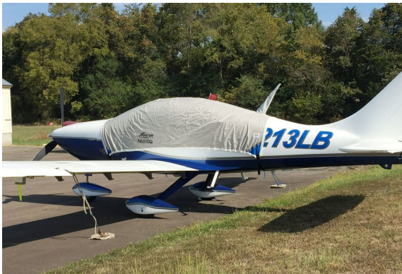
Lancair Columbia 350 Canopy Cover