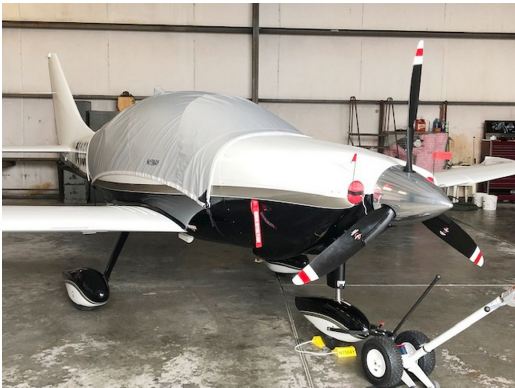
Columbia 350 Travel Cover, Engine Plugs