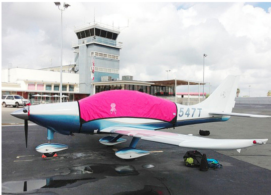
Cessna Corvalis Canopy Cover (Pink Cover Program)

This cover type is made from Silver Acrylic Sunbrella canvas and is 100% lined with a soft and smooth microfiber. Bruce's Custom Covers developed this material combination especially for aircraft protection. The outer material is medium weight and treated for water resistance, UV resistance and anti-static buildup. The inner lining is a very soft and smooth microfiber to prevent scratching. The material is very reflective, and tests show that the cabin interior temperature can be reduced to near-ambient temperature on the hottest of days. It is water, ice and snow repellent, yet breathable to allow moisture to escape from between the cover and the aircraft surface.