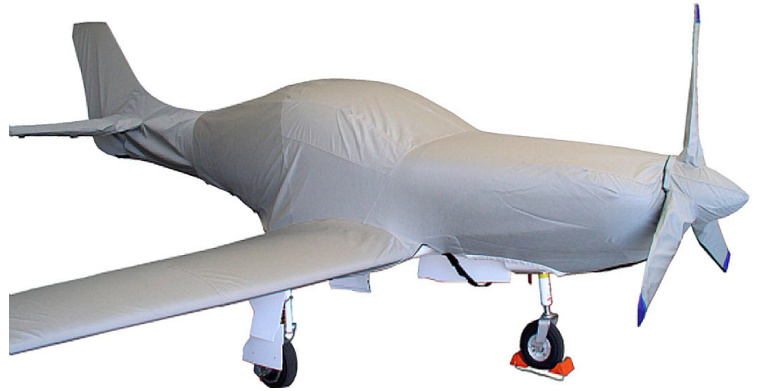
Lancair 320 Complete Fuselage/Wing Cover & Prop Cover