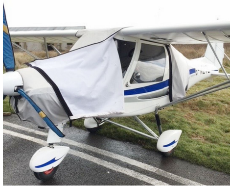
Ikarus C-42 Extended Canopy/Engine Cover