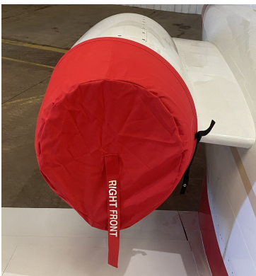
Cessna 501 Engine Covers NO TR's