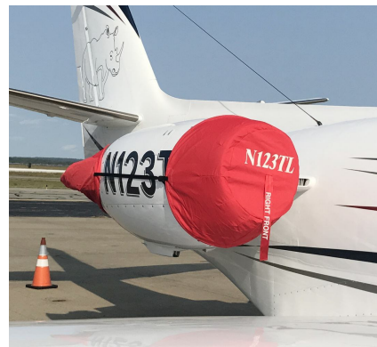
Cessna Citation S/II (S550) Engine Covers (With Tr's)