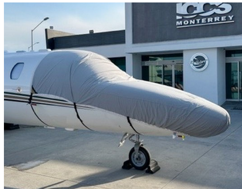
Cessna Citation Windshield Cover, Engine Cover set and Pitot Covers Cessna Citationjet 525B Travel Weight Cockpit/Nose Cover