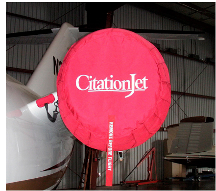
Cessna Citation Engine Cover Set