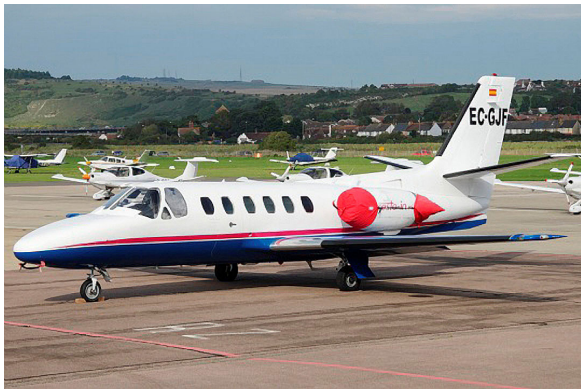
Cessna Citation II Engine Covers, Pitot Covers

The Cessna Citation I (500/501) Intake Covers are designed to install easily yet be completely storable. A spring steel hoop is sewn into the hem of each cover, allowing them to be installed without climbing onto the wing or using a stepladder. To store the covers the spring steel hoop folds like a band-saw blade into three nesting rings. Each cover folds into a compact circular bundle which is stored in the included duffle bag, yet they unfold quickly for use. The Tri-Fold Ring cover is made of medium weight nylon which is available in a variety of colors to match the paint trim. Each cover set comes complete with installation and folding instructions. The aircraft's registration number can be silkscreened onto the cover for an extra charge.