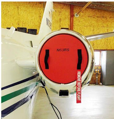
Cessna Citation S2 Intake Plugs

The Engine Inlet Plugs are custom fit for your Cessna Citation I (500/501) intakes, made with heavy-duty vinyl material, and stuffed with a single block of sculpted urethane foam. Each plug has a zipper that allows the foam to be removed and dried if necessary. Engine plugs have 'remove before flight' streamers sewn onto the face of the plugs. Most plugs are imprinted with the aircraft registration number in black for an extra charge. Storage bag NOT included. Engine plugs may be inserted after flight when the engine is still warm. Engine Inlet Plugs are commonly referred to as Cowl Plugs, Intake Plugs, Cowl Blocks, Engine Blocks, and Engine Bungs.