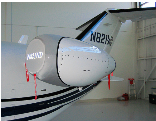
Cessna 510 Mustang Bikini Type Engine Cover

The Cessna Citation I (500/501) Intake Covers are designed to install easily yet be completely storable. A spring steel hoop is sewn into the hem of each cover, allowing them to be installed without climbing onto the wing or using a stepladder. To store the covers the spring steel hoop folds like a band-saw blade into three nesting rings. Each cover folds into a compact circular bundle which is stored in the included duffle bag, yet they unfold quickly for use. The Tri-Fold Ring cover is made of medium weight nylon which is available in a variety of colors to match the paint trim. Each cover set comes complete with installation and folding instructions. The aircraft's registration number can be silkscreened onto the cover for an extra charge.