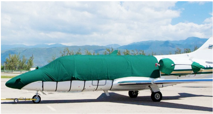
Raytheon Beechjet 400 Fuselage/Nose Cover, Engine Covers