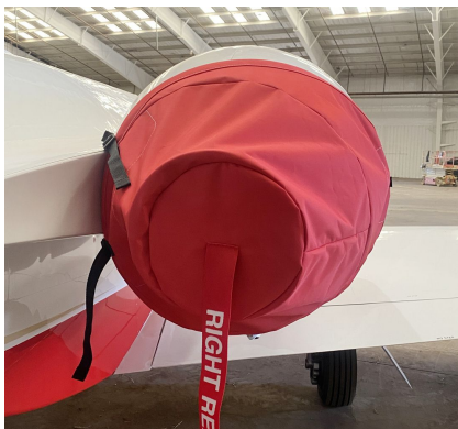
Cessna 501 Engine Covers NO TR's

The Cessna Citation I (500/501) Intake Covers are designed to install easily yet be completely storable. A spring steel hoop is sewn into the hem of each cover, allowing them to be installed without climbing onto the wing or using a stepladder. To store the covers the spring steel hoop folds like a band-saw blade into three nesting rings. Each cover folds into a compact circular bundle which is stored in the included duffle bag, yet they unfold quickly for use. The Tri-Fold Ring cover is made of medium weight nylon which is available in a variety of colors to match the paint trim. Each cover set comes complete with installation and folding instructions. The aircraft's registration number can be silkscreened onto the cover for an extra charge.