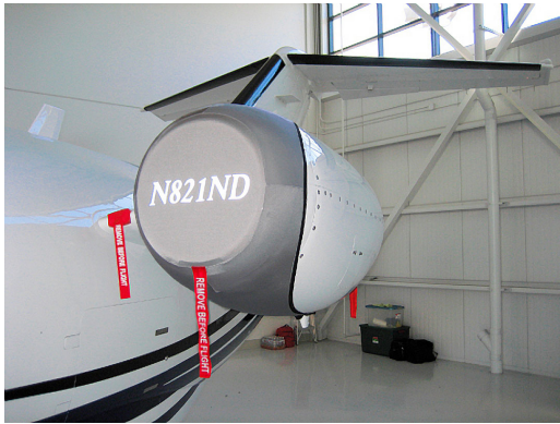
Citation Mustang Intake/Exhaust Cover, "Bikini" Type and leading edge Pylon inlet plugs

The Engine Inlet Plugs are custom fit for your Cessna Mustang 510 intakes, made with heavy-duty vinyl material, and stuffed with a single block of sculpted urethane foam. Each plug has a zipper that allows the foam to be removed and dried if necessary. Engine plugs have 'remove before flight' streamers sewn onto the face of the plugs. Most plugs are imprinted with the aircraft registration number in black for an extra charge. Storage bag NOT included. Engine plugs may be inserted after flight when the engine is still warm. Engine Inlet Plugs are commonly referred to as Cowl Plugs, Intake Plugs, Cowl Blocks, Engine Blocks, and Engine Bungs.