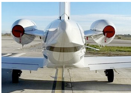
Cessna Mustang Exhaust Plugs

The Cessna Mustang 510 Intake/Exhaust Plugs are custom fit for the intake and exhaust openings, made with heavy-duty vinyl material, and stuffed with a single block of sculpted urethane foam. Each plug has a zipper that allows the foam to be removed and dried if necessary. Engine plugs have 'remove before flight' streamers sewn onto the face of the plugs. Most plugs are imprinted with the aircraft registration number in black. Engine plugs may be inserted after flight when the engine is still warm. Engine Inlet Plugs are commonly referred to as Cowl Plugs, Intake Plugs, Cowl Blocks, Engine Blocks, and Engine Bungs.