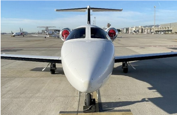
Cessna Mustang Engine Inlet Plugs

The Engine Inlet Plugs are custom fit for your Cessna Mustang 510 intakes, made with heavy-duty vinyl material, and stuffed with a single block of sculpted urethane foam. Each plug has a zipper that allows the foam to be removed and dried if necessary. Engine plugs have 'remove before flight' streamers sewn onto the face of the plugs. Most plugs are imprinted with the aircraft registration number in black for an extra charge. Storage bag NOT included. Engine plugs may be inserted after flight when the engine is still warm. Engine Inlet Plugs are commonly referred to as Cowl Plugs, Intake Plugs, Cowl Blocks, Engine Blocks, and Engine Bungs.