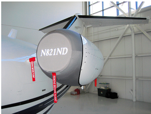
Citation Mustang Intake/Exhaust Cover, "Bikini" Type and leading edge Pylon inlet plugs

The Cessna Mustang 510 Intake/Exhaust Plugs are custom fit for the intake and exhaust openings, made with heavy-duty vinyl material, and stuffed with a single block of sculpted urethane foam. Each plug has a zipper that allows the foam to be removed and dried if necessary. Engine plugs have 'remove before flight' streamers sewn onto the face of the plugs. Most plugs are imprinted with the aircraft registration number in black. Engine plugs may be inserted after flight when the engine is still warm. Engine Inlet Plugs are commonly referred to as Cowl Plugs, Intake Plugs, Cowl Blocks, Engine Blocks, and Engine Bungs.