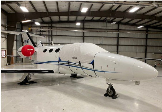
Cessna 510 Cockpit Cover extends to cover door

This cover type is made from Silver Acrylic Sunbrella canvas and is 100% lined with a soft and smooth microfiber. Bruce's Custom Covers developed this material combination especially for aircraft protection. The outer material is medium weight and treated for water resistance, UV resistance and anti-static buildup. The inner lining is a very soft and smooth microfiber to prevent scratching. The material is very reflective, and tests show that the cabin interior temperature can be reduced to near-ambient temperature on the hottest of days. It is water, ice and snow repellent, yet breathable to allow moisture to escape from between the cover and the aircraft surface.