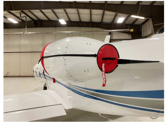
Cessna 510 Engine Inlet Covers & Exhaust Plugs