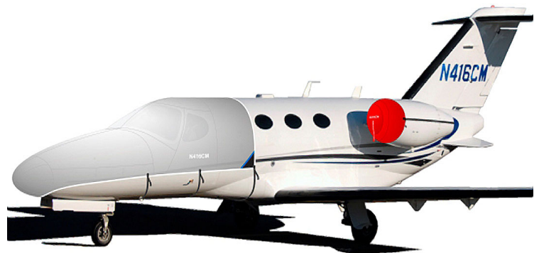
Citation Mustang Windshield Cover, Intake Cover/Exhaust Plug Set, Pitot Covers