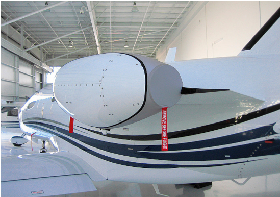
Citation Mustang Intake/Exhaust Cover, "Bikini" Type and leading edge Pylon inlet plugs

The Cessna Mustang 510 Intake/Exhaust Plugs are custom fit for the intake and exhaust openings, made with heavy-duty vinyl material, and stuffed with a single block of sculpted urethane foam. Each plug has a zipper that allows the foam to be removed and dried if necessary. Engine plugs have 'remove before flight' streamers sewn onto the face of the plugs. Most plugs are imprinted with the aircraft registration number in black. Engine plugs may be inserted after flight when the engine is still warm. Engine Inlet Plugs are commonly referred to as Cowl Plugs, Intake Plugs, Cowl Blocks, Engine Blocks, and Engine Bungs.