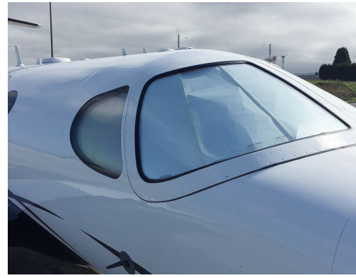
Cessna Mustang 510 Cockpit Heatshields