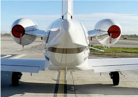
Cessna Mustang Exhaust Plugs