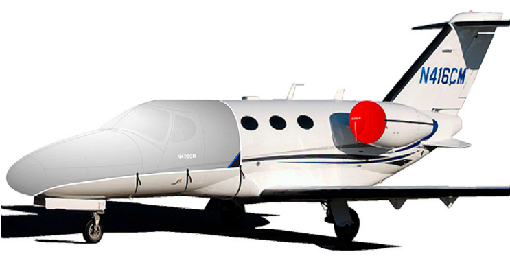
Citation Mustang Light Weight Travel Windshield Cover, "Bikini" type Engine Cover Set Citation Mustang Cockpit/Door/Nose Cover, Engine Inlet Cover