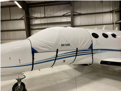
Cessna 510 Cockpit Cover extends to cover door