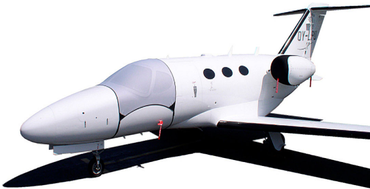
Citation Mustang Light Weight Travel Windshield Cover, "Bikini" type Engine Cover Set

Travel Covers are made with Silver Solution-Dyed Polyester fabric and only lined over the windshield to save weight. The material is lightweight and more compact for easy stowage in the aircraft. The polyester material is water resistant, but only intended for occasional use outside. We also have an ultra lightweight material available for fitted hangar dust covers. For daily outdoor use, the non-travel Sunbrella Cover is the best choice.