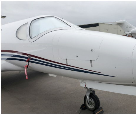
Cessna Mustang 510 Cockpit Heatshields, Pitot Cover/AOA

The Engine Inlet Plugs are custom fit for your Cessna Mustang 510 intakes, made with heavy-duty vinyl material, and stuffed with a single block of sculpted urethane foam. Each plug has a zipper that allows the foam to be removed and dried if necessary. Engine plugs have 'remove before flight' streamers sewn onto the face of the plugs. Most plugs are imprinted with the aircraft registration number in black for an extra charge. Storage bag NOT included. Engine plugs may be inserted after flight when the engine is still warm. Engine Inlet Plugs are commonly referred to as Cowl Plugs, Intake Plugs, Cowl Blocks, Engine Blocks, and Engine Bungs.