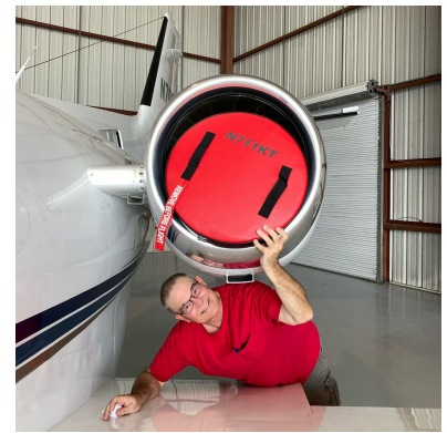
Citation II Engine Plugs