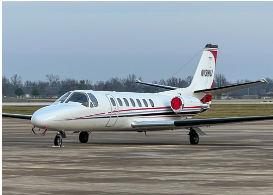
Citationjet V Ultra (560) Exhaust Plugs (set of 2)

The Engine Inlet Plugs are custom fit for your Cessna Citationjet V Ultra & Encore Models intakes, made with heavy-duty vinyl material, and stuffed with a single block of sculpted urethane foam. Each plug has a zipper that allows the foam to be removed and dried if necessary. Engine plugs have 'remove before flight' streamers sewn onto the face of the plugs. Most plugs are imprinted with the aircraft registration number in black for an extra charge. Storage bag NOT included. Engine plugs may be inserted after flight when the engine is still warm. Engine Inlet Plugs are commonly referred to as Cowl Plugs, Intake Plugs, Cowl Blocks, Engine Blocks, and Engine Bungs.