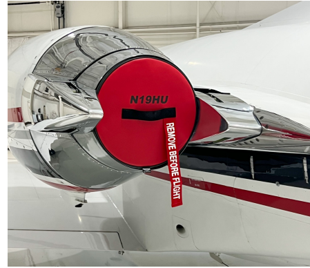
Cessna Citationjet V Ultra (560) Exhaust Plugs