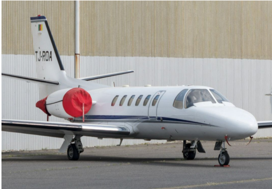
Cessna Citation II Bravo Engine Covers

The Cessna Citationjet V Ultra (560) Intake/Exhaust Plugs are custom fit for the intake and exhaust openings, made with heavy-duty vinyl material, and stuffed with a single block of sculpted urethane foam. Each plug has a zipper that allows the foam to be removed and dried if necessary. Engine plugs have 'remove before flight' streamers sewn onto the face of the plugs. Most plugs are imprinted with the aircraft registration number in black. Engine plugs may be inserted after flight when the engine is still warm. Engine Inlet Plugs are commonly referred to as Cowl Plugs, Intake Plugs, Cowl Blocks, Engine Blocks, and Engine Bungs.