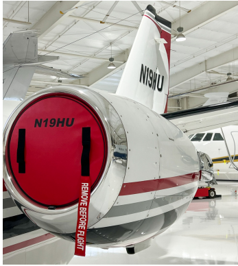
Cessna Citationjet V Ultra (560) Exhaust Plugs

The Engine Inlet Plugs are custom fit for your Cessna Citationjet V Ultra & Encore Models intakes, made with heavy-duty vinyl material, and stuffed with a single block of sculpted urethane foam. Each plug has a zipper that allows the foam to be removed and dried if necessary. Engine plugs have 'remove before flight' streamers sewn onto the face of the plugs. Most plugs are imprinted with the aircraft registration number in black for an extra charge. Storage bag NOT included. Engine plugs may be inserted after flight when the engine is still warm. Engine Inlet Plugs are commonly referred to as Cowl Plugs, Intake Plugs, Cowl Blocks, Engine Blocks, and Engine Bungs.