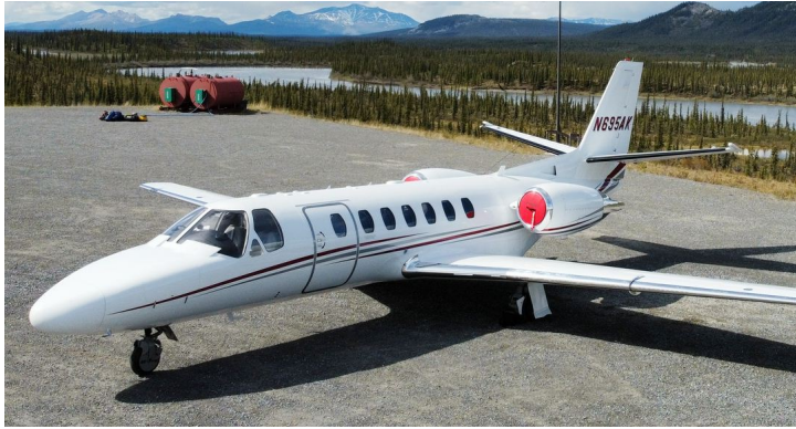
Cessna Citationjet V Ultra (560) Intake Plugs, With Pylon Plugs

The Engine Inlet Plugs are custom fit for your Cessna Citationjet V Ultra (560) intakes, made with heavy-duty vinyl material, and stuffed with a single block of sculpted urethane foam. Each plug has a zipper that allows the foam to be removed and dried if necessary. Engine plugs have 'remove before flight' streamers sewn onto the face of the plugs. Most plugs are imprinted with the aircraft registration number in black for an extra charge. Storage bag NOT included. Engine plugs may be inserted after flight when the engine is still warm. Engine Inlet Plugs are commonly referred to as Cowl Plugs, Intake Plugs, Cowl Blocks, Engine Blocks, and Engine Bungs.