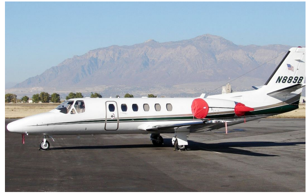
Citation Bravo Tri-Fold Engine Covers