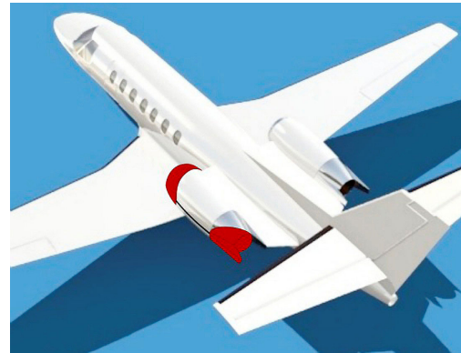
Cessna Citation II with TR's Exhaust Cover Illustration