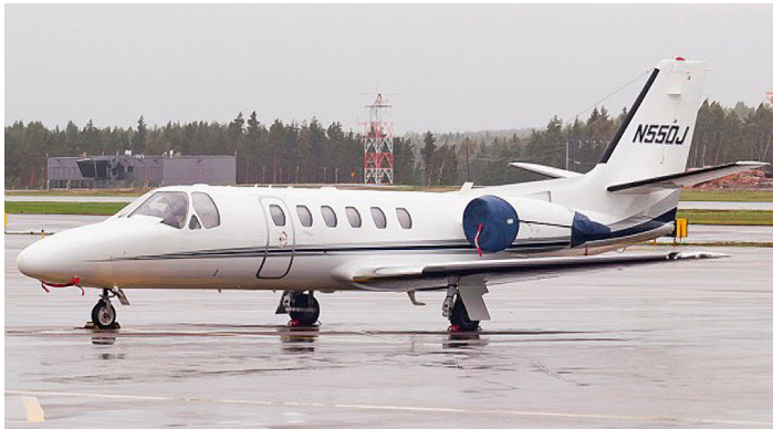
Cessna Citation Bravo Engine Covers and Pitot Covers sets

The Cessna Citation II Bravo Intake/Exhaust Plugs are custom fit for the intake and exhaust openings, made with heavy-duty vinyl material, and stuffed with a single block of sculpted urethane foam. Each plug has a zipper that allows the foam to be removed and dried if necessary. Engine plugs have 'remove before flight' streamers sewn onto the face of the plugs. Most plugs are imprinted with the aircraft registration number in black. Engine plugs may be inserted after flight when the engine is still warm. Engine Inlet Plugs are commonly referred to as Cowl Plugs, Intake Plugs, Cowl Blocks, Engine Blocks, and Engine Bungs.