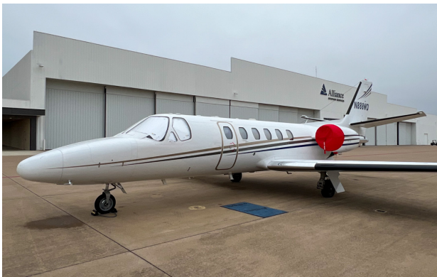
Cessna 550 Intake Covers & Exhaust Plugs, includes wedge plug for nacelle recommended (set of 6)