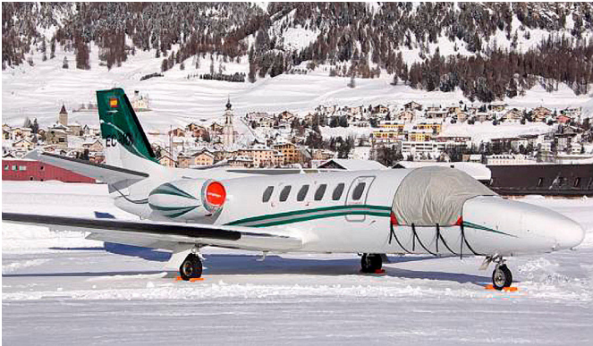
Cessna Citation 550 Windshield Cover