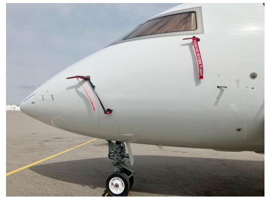
Challenger 650 Pitot & Ice Detector Covers