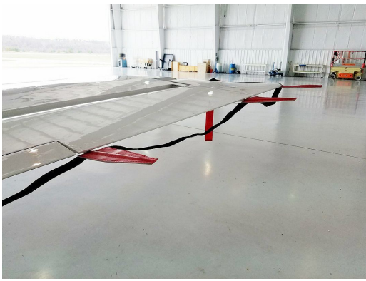
Hawker Beechcraft 800, 800XP, 850XP Static Wick Protectors