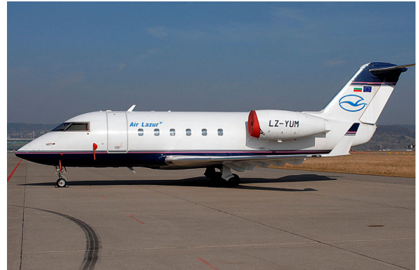
Challenger 600 Intake Covers