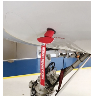
Grumman Gulfstream G-V Rosemont/TAT Cover