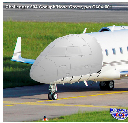
Challenger 601/604 Cockpit/Nose Cover, illustration