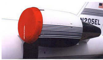
Alternate Intake Cover Design