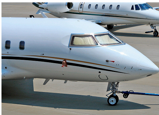
Challenger 604 Cockpit HeatShields