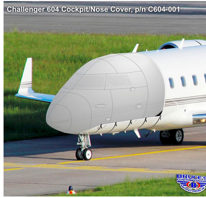
Challenger 601/604 Cockpit/Nose Cover, illustration

the hottest of days. It is water, ice and snow repellent, yet breathable to allow moisture to escape from between the cover and the aircraft surface.