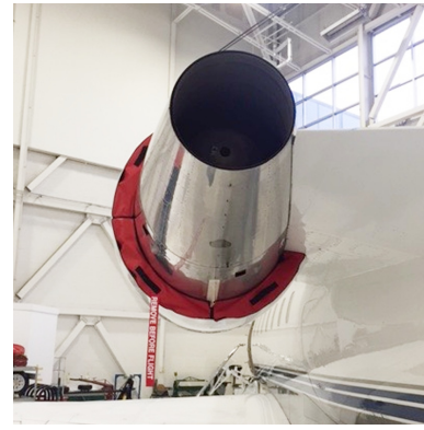
Canadair Challenger 604 Bypass Plugs