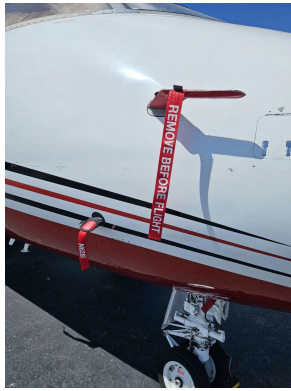
Canadair Challenger 601 Pitot Covers, Heat Resistant Type