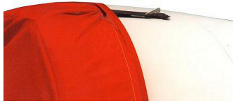
Alternate Intake Cover Design