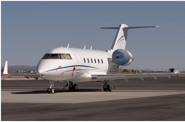
Challenger 604 Intake Covers, standard design