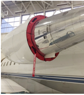
Canadair Challenger 604 Bypass Plugs