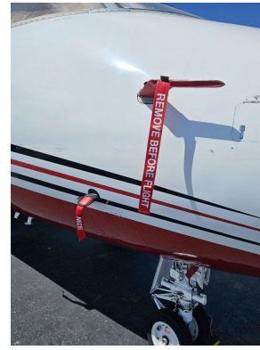
Canadair Challenger 601 Pitot Covers, Heat Resistant Type