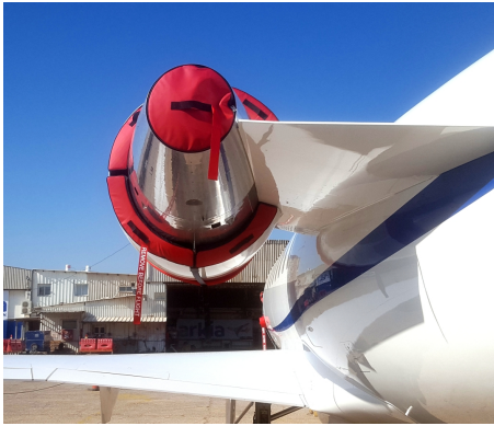
Canadair Challenger 604, 605, 650, 850 Exhaust Plugs

dried if necessary. Engine plugs have 'remove before flight' streamers sewn onto the face of the plugs. Most plugs are imprinted with the aircraft registration number in black for an extra charge. Storage bag NOT included. Engine plugs may be inserted after flight when the engine is still warm. Engine Inlet Plugs are commonly referred to as Cowl Plugs, Intake Plugs, Cowl Blocks, Engine Blocks, and Engine Bungs.