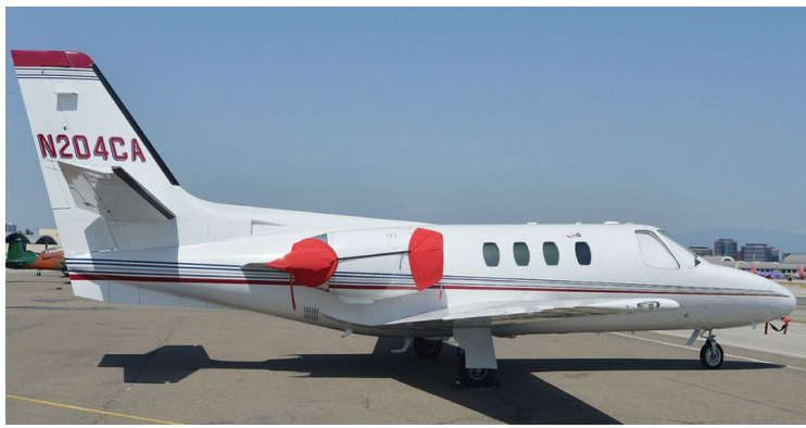
Cessna Citation Engine Covers and Heatshields