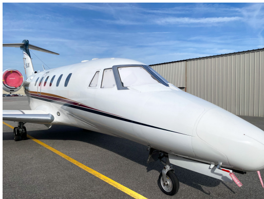
Cessna 650 Cockpit Heatshields (set of 6)

Cockpit Heatshields are interior sunshades for the aircraft's cockpit. The product is a unique composite of closed-cell foam with a silver mylar finish. The semi-rigid design is stiff enough to stand inside the window framing. The set folds up flat and is easily stored in the included storage sleeve. Some designs may require velcro and suction cups. Our Heatshields for jets are offered white side out because some aircraft manufacturers have issued advisories against reflective window inserts due to potential heat damage. A Heatshield is an excellent short-term remedy for cockpit overheating, but an external fabric cover is more effective for long-term protection.