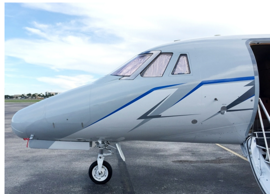
Cessna Citation 650 Cockpit HeataShields