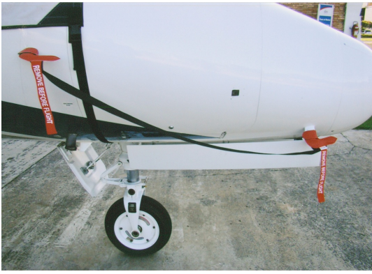
Citation XL Pitot Covers