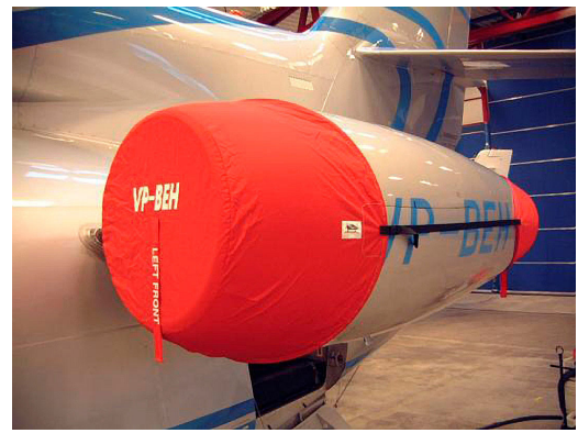
Falcon 900 Sovereign Engine Covers