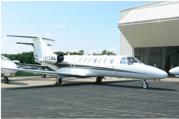
Cessna Citation CJ3 Bikini Style Engine Covers

The Cessna Citation VII (650) Intake/Exhaust Plugs are custom fit for the intake and exhaust openings, made with heavy-duty vinyl material, and stuffed with a single block of sculpted urethane foam. Each plug has a zipper that allows the foam to be removed and dried if necessary. Engine plugs have 'remove before flight' streamers sewn onto the face of the plugs. Most plugs are imprinted with the aircraft registration number in black. Engine plugs may be inserted after flight when the engine is still warm. Engine Inlet Plugs are commonly referred to as Cowl Plugs, Intake Plugs, Cowl Blocks, Engine Blocks, and Engine Bungs.