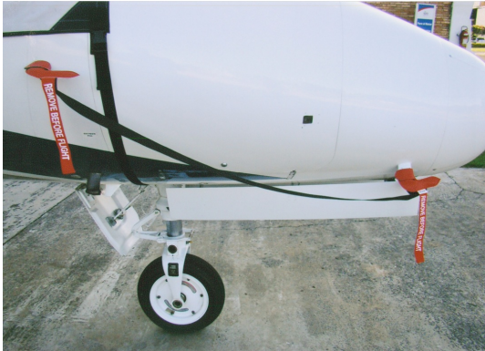
Citation XL Pitot Covers

The Engine Inlet Plugs are custom fit for your Cessna Citation VII (650) intakes, made with heavy-duty vinyl material, and stuffed with a single block of sculpted urethane foam. Each plug has a zipper that allows the foam to be removed and dried if necessary. Engine plugs have 'remove before flight' streamers sewn onto the face of the plugs. Most plugs are imprinted with the aircraft registration number in black for an extra charge. Storage bag NOT included. Engine plugs may be inserted after flight when the engine is still warm. Engine Inlet Plugs are commonly referred to as Cowl Plugs, Intake Plugs, Cowl Blocks, Engine Blocks, and Engine Bungs.