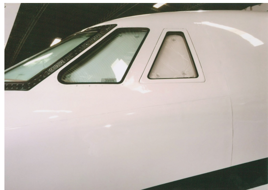
Citation XL Cockpit HeatShields