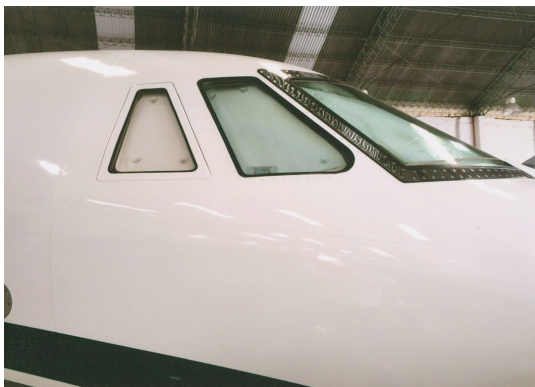
Citation XL Cockpit HeatShields

Cockpit Heatshields are interior sunshades for the aircraft's cockpit. The product is a unique composite of closed-cell foam with a silver mylar finish. The semi-rigid design is stiff enough to stand inside the window framing. The set folds up flat and is easily stored in the included storage sleeve. Some designs may require velcro and suction cups. Our Heatshields for jets are offered white side out because some aircraft manufacturers have issued advisories against reflective window inserts due to potential heat damage. A Heatshield is an excellent short-term remedy for cockpit overheating, but an external fabric cover is more effective for long-term protection.