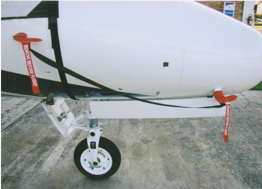
Citation XL Pitot Covers

The Engine Inlet Plugs are custom fit for your Cessna Citation VII (650) intakes, made with heavy-duty vinyl material, and stuffed with a single block of sculpted urethane foam. Each plug has a zipper that allows the foam to be removed and dried if necessary. Engine plugs have 'remove before flight' streamers sewn onto the face of the plugs. Most plugs are imprinted with the aircraft registration number in black for an extra charge. Storage bag NOT included. Engine plugs may be inserted after flight when the engine is still warm. Engine Inlet Plugs are commonly referred to as Cowl Plugs, Intake Plugs, Cowl Blocks, Engine Blocks, and Engine Bungs.