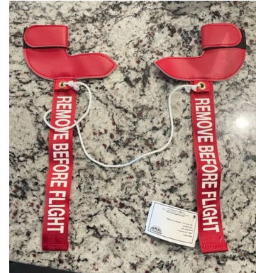
Cessna Citation Pitot Cover Set