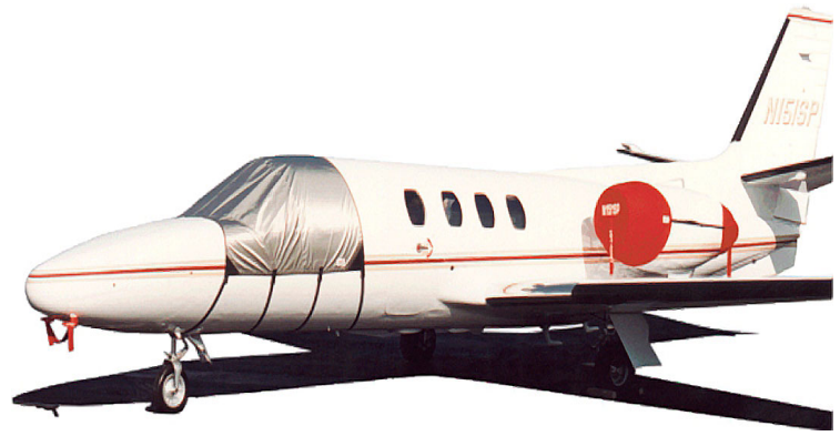
Cessna Citation I Windshield, Pitot and Engine Covers