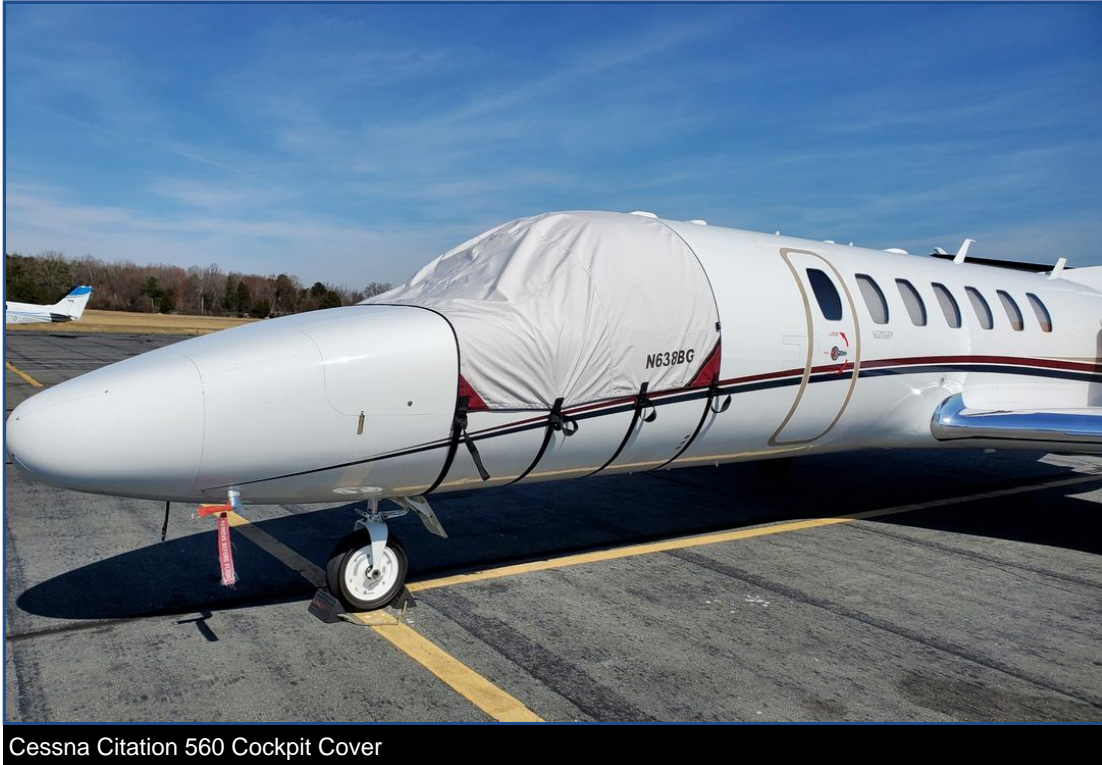
Cessna Citation 560 Cockpit Cover