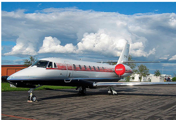
Citation Sovereign Engine Covers

The Cessna Citation Latitude (680A) Intake/Exhaust Plugs are custom fit for the intake and exhaust openings, made with heavy-duty vinyl material, and stuffed with a single block of sculpted urethane foam. Each plug has a zipper that allows the foam to be removed and dried if necessary. Engine plugs have 'remove before flight' streamers sewn onto the face of the plugs. Most plugs are imprinted with the aircraft registration number in black. Engine plugs may be inserted after flight when the engine is still warm. Engine Inlet Plugs are commonly referred to as Cowl Plugs, Intake Plugs, Cowl Blocks, Engine Blocks, and Engine Bungs.