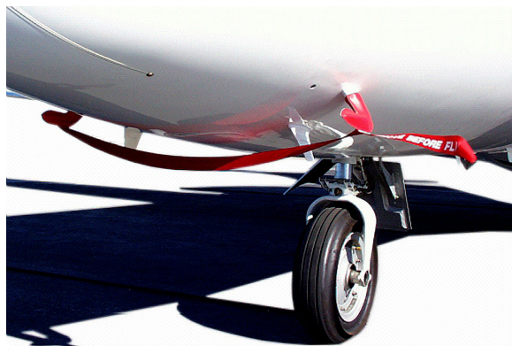
Cessna Citation I Pitot Covers