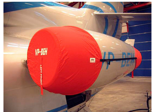
Falcon 900 Sovereign Engine Covers