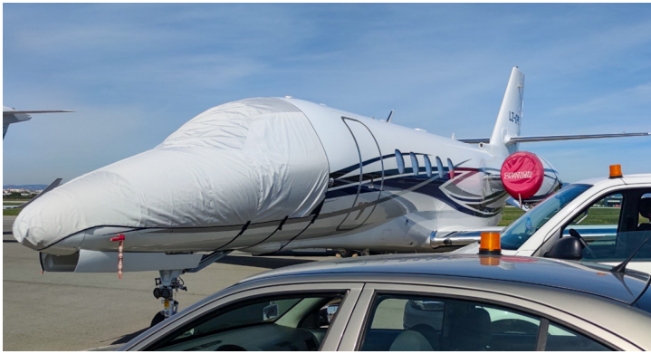
Cessna Citation Latitude (680A) Cockpit/Nose Cover, Doesn't Cover Pitot Tubes