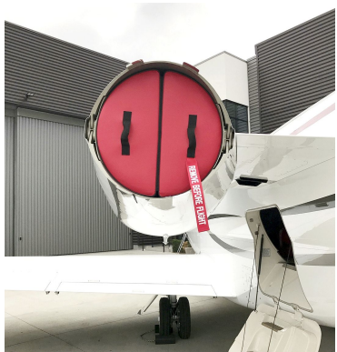
Cessna Citation 680 Exhaust Plugs, folding type

The Engine Inlet Plugs are custom fit for your Cessna Citation Latitude (680A) intakes, made with heavy-duty vinyl material, and stuffed with a single block of sculpted urethane foam. Each plug has a zipper that allows the foam to be removed and dried if necessary. Engine plugs have 'remove before flight' streamers sewn onto the face of the plugs. Most plugs are imprinted with the aircraft registration number in black for an extra charge. Storage bag NOT included. Engine plugs may be inserted after flight when the engine is still warm. Engine Inlet Plugs are commonly referred to as Cowl Plugs, Intake Plugs, Cowl Blocks, Engine Blocks, and Engine Bungs.