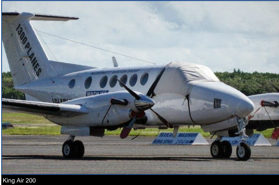
King Air 200