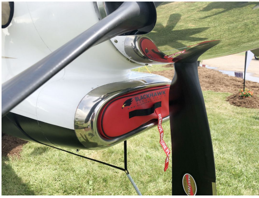
Beech C90A Intake Plugs