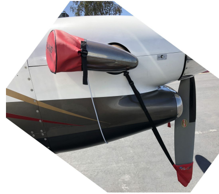
Beech King Air C90A Engine Plugs & Prop Tie/Exhaust Covers Beech King Air 350 Prop Tie-Downs/Exhaust Covers Combination