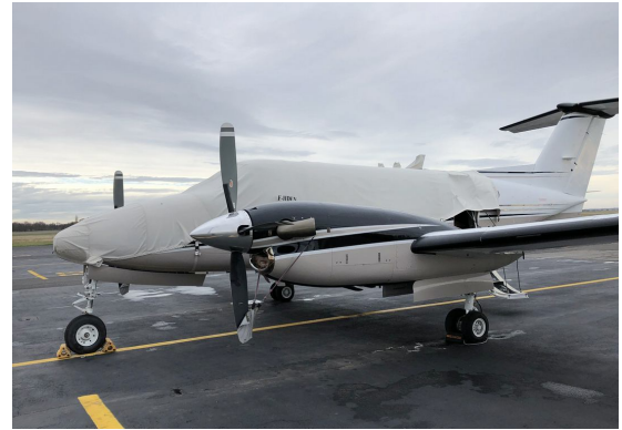
King Air 200 Canopy/Nose Cover