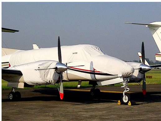
King Air 350 Canopy/Nose Cover, Engine Covers

ALL-YEAR USE MATERIAL - Made with Silver Acrylic Sunbrella canvas, the all-year use material is the best option for sun protection and cover longevity. This heavier more durable material is intended for all weather conditions, such as rain and snow or lots of sun.