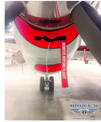
Engine and Oil Cooler Inlet Plugs