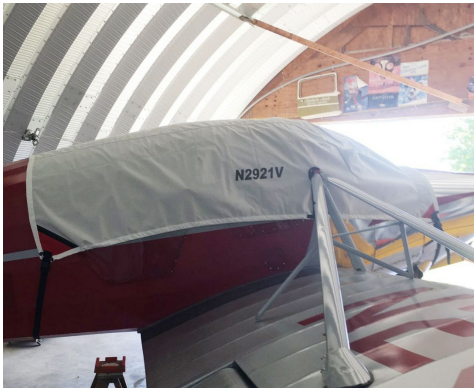
Callair A-2 Canopy Cover

Canopy Covers are commonly referred to as Cabin Covers, Fuselage Covers, Canvas Covers, Canopy Caps, etc.