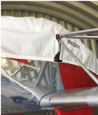
Callair A-2 Canopy Cover