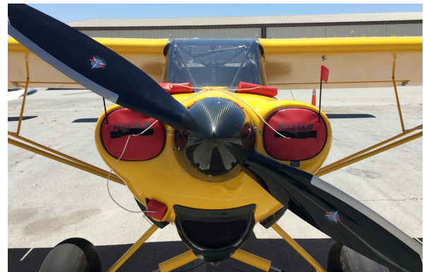
Cub Crafters CC-11 Carbon Cub Engine Plugs