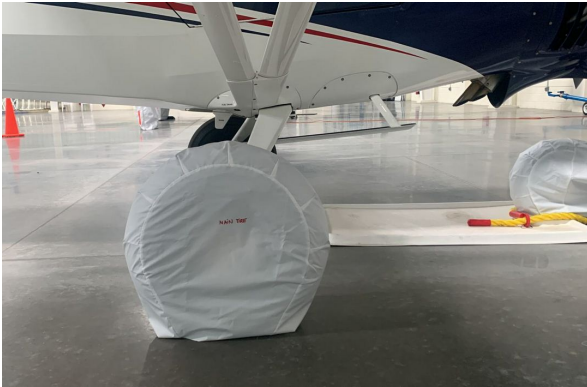
Cub Crafters Tire Covers, tricycle gear, test fit covers

ALL-YEAR USE MATERIAL - Made with Silver Acrylic Sunbrella canvas, the all-year use material is the best option for sun protection and cover longevity. This heavier more durable material is intended for all weather conditions, such as rain and snow or lots of sun.