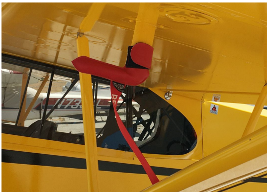
Cub Crafters CC-11 Carbon Cub Pitot Cover

Engine Inlet Plugs are custom fit for your CubCrafters CC-11, Sport Cub S2, & Carbon Cub intakes, made with heavy-duty vinyl material, and stuffed with a single block of sculpted urethane foam. Each plug has a zipper that allows the foam to be removed and dried if necessary. Engine plugs have warning flags that are visible from the cockpit or 'remove before flight' streamers sewn onto the face of the plugs. Most plugs are imprinted with the aircraft registration number in black for an extra charge. Storage bag NOT included. Engine plugs may be inserted after flight when the engine is still warm. Engine Inlet Plugs are commonly referred to as Cowl Plugs, Intake Plugs, Cowl Blocks, Engine Blocks, and Engine Bungs.