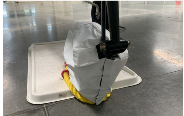
Cub Crafters Tire Covers, tricycle gear, test fit covers