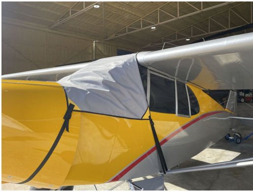
Piper PA-18 Windshield/Skylight Cover