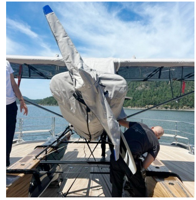
Cub Crafters CC-11 Complete Cover Set