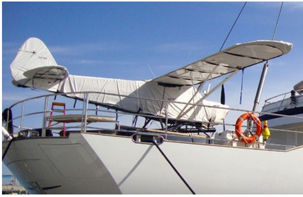
Cub Crafters CC-11 Complete Cover Set