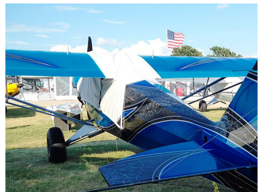
Cub Crafters Carbon Cub Canopy Cover