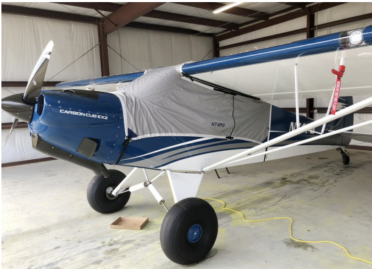
Cub Crafter's Carbon Cub Travel Weight Canopy Cover

This cover type is made from Silver Acrylic Sunbrella canvas and is 100% lined with a soft and smooth microfiber. Bruce's Custom Covers developed this material combination especially for aircraft protection. The outer material is medium weight and treated for water resistance, UV resistance and anti-static buildup. The inner lining is a very soft and smooth microfiber to prevent scratching. The material is very reflective, and tests show that the cabin interior temperature can be reduced to near-ambient temperature on the hottest of days. It is water, ice and snow repellent, yet breathable to allow moisture to escape from between the cover and the aircraft surface.