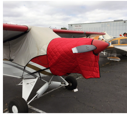
FOR INTERIOR USE. CubCrafters CC-11 Insulated Hangar Blanket, available in Red or Silver