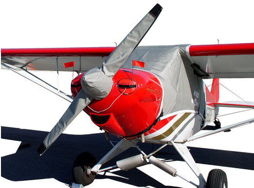
CubCrafters Sport Cub Prop Cover & Engine Plugs

Engine Inlet Plugs are custom fit for your CubCrafters CC-18, 19, 20, Top Cub, CCK-1865, CC-19 X-Cub, CCX-2000, EX-3, FX-3 intakes, made with heavy-duty vinyl material, and stuffed with a single block of sculpted urethane foam. Each plug has a zipper that allows the foam to be removed and dried if necessary. Engine plugs have warning flags that are visible from the cockpit or 'remove before flight' streamers sewn onto the face of the plugs. Most plugs are imprinted with the aircraft registration number in black for an extra charge. Storage bag NOT included. Engine plugs may be inserted after flight when the engine is still warm. Engine Inlet Plugs are commonly referred to as Cowl Plugs, Intake Plugs, Cowl Blocks, Engine Blocks, and Engine Bungs.