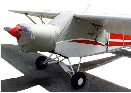
Piper PA-18 Super Cub Canopy & Engine Covers