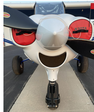
CubCrafters CC-18, 19, 20, Top Cub, CCK-1865, CC-19 X-Cub, CCX-2000, EX-3, FX-3 Engine Inlet Plugs