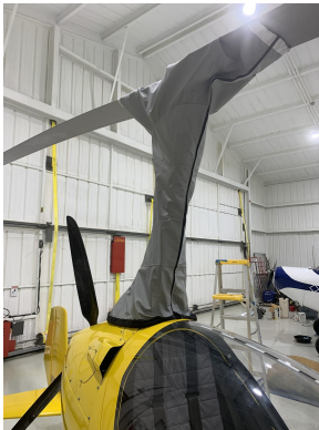
Autogyro Calidus Gyrocopter Rotor Hub/Mast Cover

Rotor Hub Covers overlaps with the Blade Covers to ensure complete protection for the entire main rotor system. Designed like a jacket with sleeves and no collar, the rotor hub cover fastens together below each blade with Delrin buckles. The Rotor Hub Cover is normally made from Solution-Dyed Polyester.