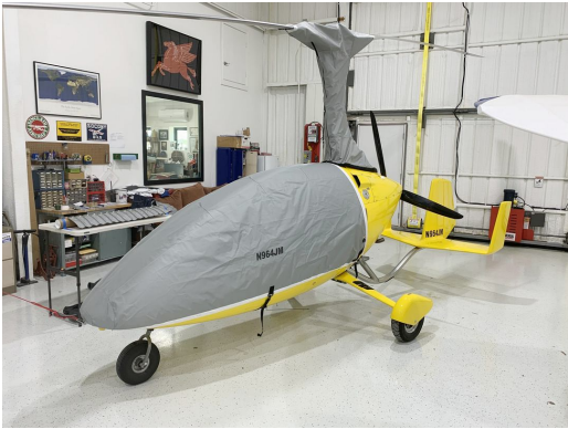
Autogyro Calidus Gyrocopter Canopy/Nose & Rotor Hub/Mast Cover

Travel Covers are made with Silver Solution-Dyed Polyester fabric and fully lined over the entire cover. The material is lightweight and more compact for easy storage in the aircraft. The polyester material is water resistant, but only intended for occasional use outside. We also have an ultra lightweight material available for fitted hangar dust covers. For daily outdoor use, the non-travel Sunbrella Cover is the best choice.