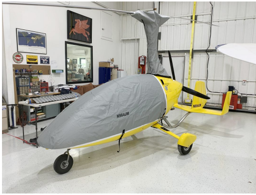
Autogyro Calidus Gyrocopter Canopy/Nose & Rotor Hub/Mast Cover