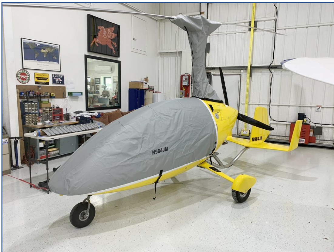
Autogyro Calidus Gyrocopter Canopy/Nose &amp; Rotor Hub/Mast Cover