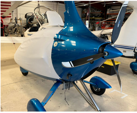
Autogyro Calidus Canopy/Nose Cover, test fit cover