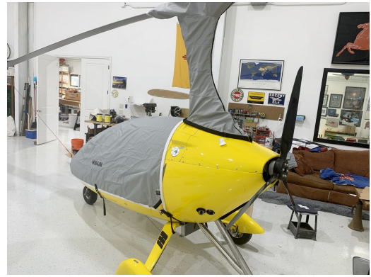
Autogyro Calidus Gyrocopter Canopy/Nose & Rotor Hub/Mast Cover