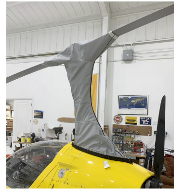
Autogyro Calidus Gyrocopter Rotor Hub/Mast Cover