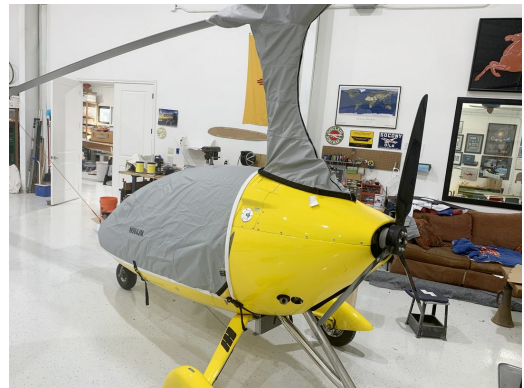
Autogyro Calidus Gyrocopter Canopy/Nose & Rotor Hub/Mast Cover