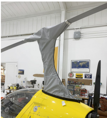
Autogyro Calidus Gyrocopter Rotor Hub/Mast Cover

Rotor Hub Covers overlaps with the Blade Covers to ensure complete protection for the entire main rotor system. Designed like a jacket with sleeves and no collar, the rotor hub cover fastens together below each blade with Delrin buckles. The Rotor Hub Cover is normally made from Solution-Dyed Polyester.