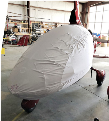
Cavalon Gyrocopter Bubble Cover, test fit cover