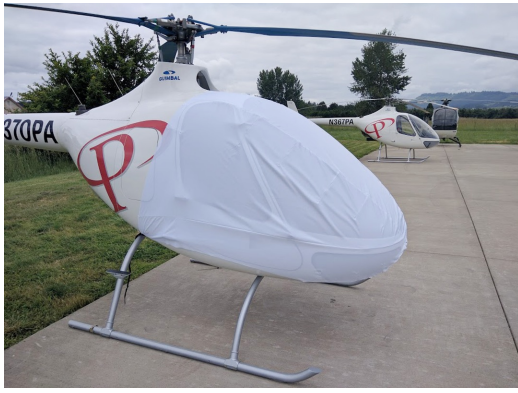
Guimbal Cabri G2 Bubble Cover, test fit cover