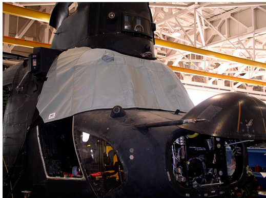
Boeing Vertol CH-47 Windshield/Cockpit Cover

water resistance, UV resistance and anti-static buildup. The inner lining is a very soft and smooth microfiber to prevent scratching. The material is very reflective, and tests show that the cabin interior temperature can be reduced to near-ambient temperature on the hottest of days. It is water, ice and snow repellent, yet breathable to allow moisture to escape from between the cover and the aircraft surface.