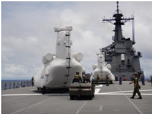
Boeing CH-47 Complete Body Cover