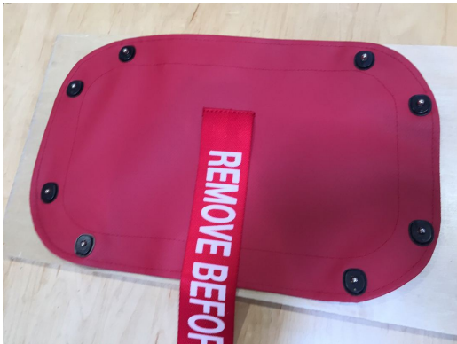
Boeing Vertol CH-47 Chinook Engine Exhaust Covers