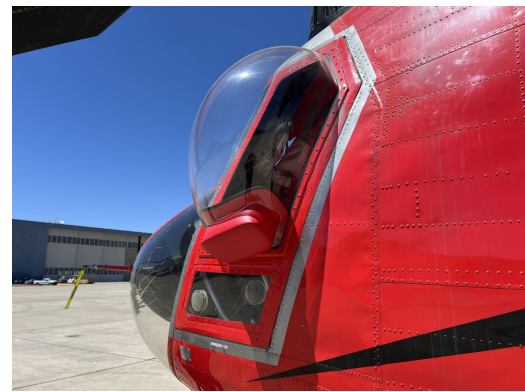
CH-47 Logger Window Plug