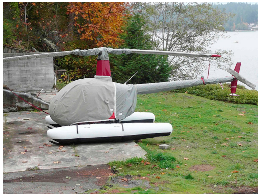
Robinson R-22 Bubble Cover (Ext. Past Rotor Hub), Engine Cover, Tailboom Cover, Blade Covers, Rotor Hub Cover, & Tail Rotor Gear Box Cover