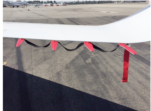
Citation X Static Wick Protectors