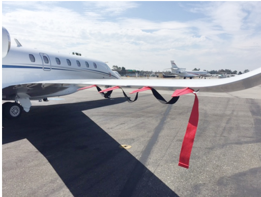
Citation X Static Wick Protectors

The Engine Exhaust Plugs are custom fit for your Cessna Citation X (750) exhaust openings, made with heavy-duty vinyl material, and stuffed with a single block of sculpted urethane foam. Each plug has a zipper that allows the foam to be removed and dried if necessary. Exhaust plugs have 'remove before flight' streamers sewn onto the face of the plugs. Most plugs are imprinted with the aircraft registration number in black for an extra charge. Exhaust plugs may be inserted soon after flight when the engine is still warm. Engine Inlet Plugs are commonly referred to as Cowl Plugs, Intake Plugs, Cowl Blocks, Engine Blocks, and Engine Bungs.