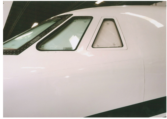
Citation XL Cockpit HeatShields