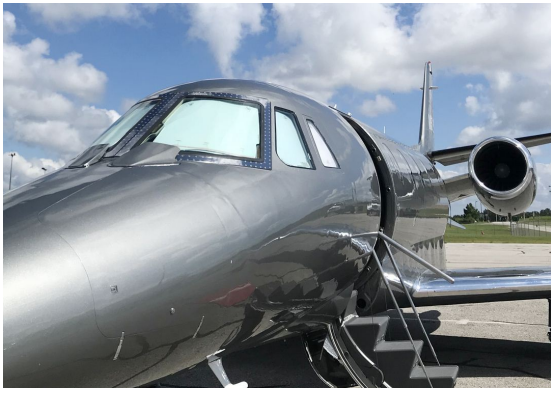
Cessna Citation 560XL Cockpit HeatShields