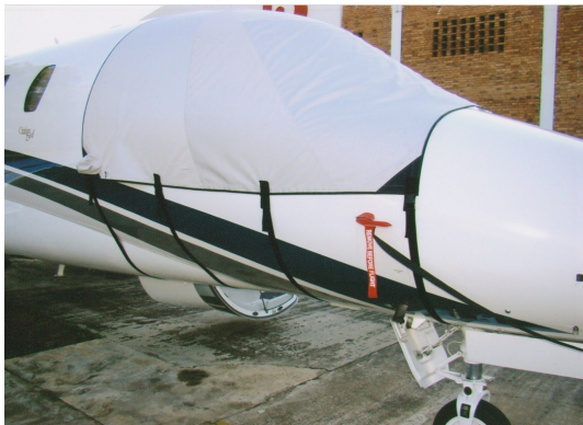
Citation XL Cockpit Cover

This cover type is made from Silver Acrylic Sunbrella canvas and is 100% lined with a soft and smooth microfiber. Bruce's Custom Covers developed this material combination especially for aircraft protection. The outer material is medium weight and treated for water resistance, UV resistance and anti-static buildup. The inner lining is a very soft and smooth microfiber to prevent scratching. The material is very reflective, and tests show that the cabin interior temperature can be reduced to near-ambient temperature on the hottest of days. It is water, ice and snow repellent, yet breathable to allow moisture to escape from between the cover and the aircraft surface.