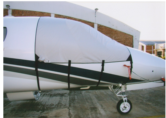
Citation XL Cockpit Cover