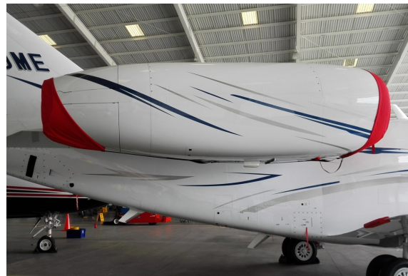
Citation X Intake/Exhaust Cover Set