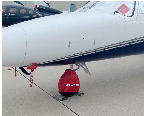
Cessna Citation Nose Tire Cover