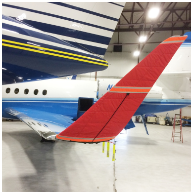
Falcon 2000 Winglet Pad

ALL-YEAR USE MATERIAL - Made with Silver Acrylic Sunbrella canvas, the all-year use material is the best option for sun protection and cover longevity. This heavier more durable material is intended for all weather conditions, such as rain and snow or lots of sun.