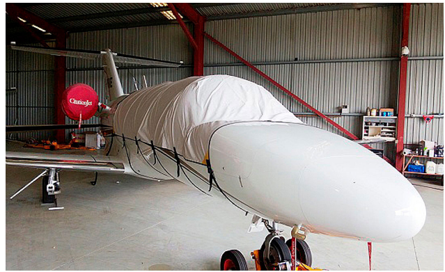
Citation CJ-1 Canopy Cover and Engine Covers