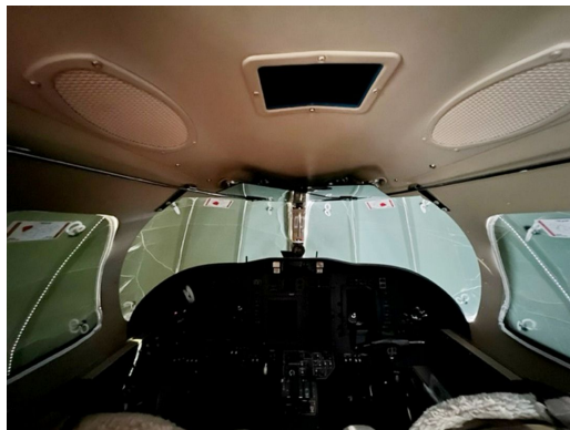
Cessna 525A Cockpit heatshields

Custom-made Heatshield Sunshades are available for almost any window in the jet. Side windows, Skylights, and Emergency Exits are all custom-made. The product is a unique composite of closed-cell foam with a silver mylar finish. The set is easily stored in the included storage sleeve. Some designs may require velcro and suction cups. Our Heatshields are offered white side out since aircraft manufacturers have issued advisories against reflective window inserts due to potential heat damage.