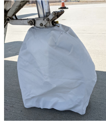
CJ1 Nose Gear Tire Cover, test fit