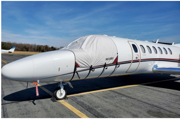
Cessna Citation 560 Cockpit Cover