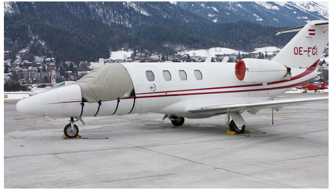
Cessna Citationjet CJ1 Cockpit Cover