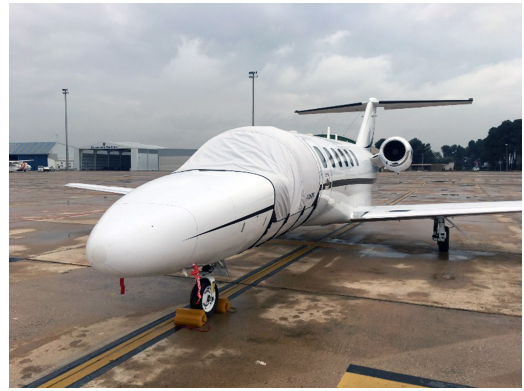
Cessna Citationjet 525A, CJ-2, & CJ2+ Cockpit Cover