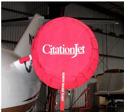
Cessna Citation Engine Cover Set

The Cessna Citationjet 525A, CJ-2, & CJ2+ Intake/Exhaust Plugs are custom fit for the intake and exhaust openings, made with heavy-duty vinyl material, and stuffed with a single block of sculpted urethane foam. Each plug has a zipper that allows the foam to be removed and dried if necessary. Engine plugs have 'remove before flight' streamers sewn onto the face of the plugs. Most plugs are imprinted with the aircraft registration number in black. Engine plugs may be inserted after flight when the engine is still warm. Engine Inlet Plugs are commonly referred to as Cowl Plugs, Intake Plugs, Cowl Blocks, Engine Blocks, and Engine Bung.