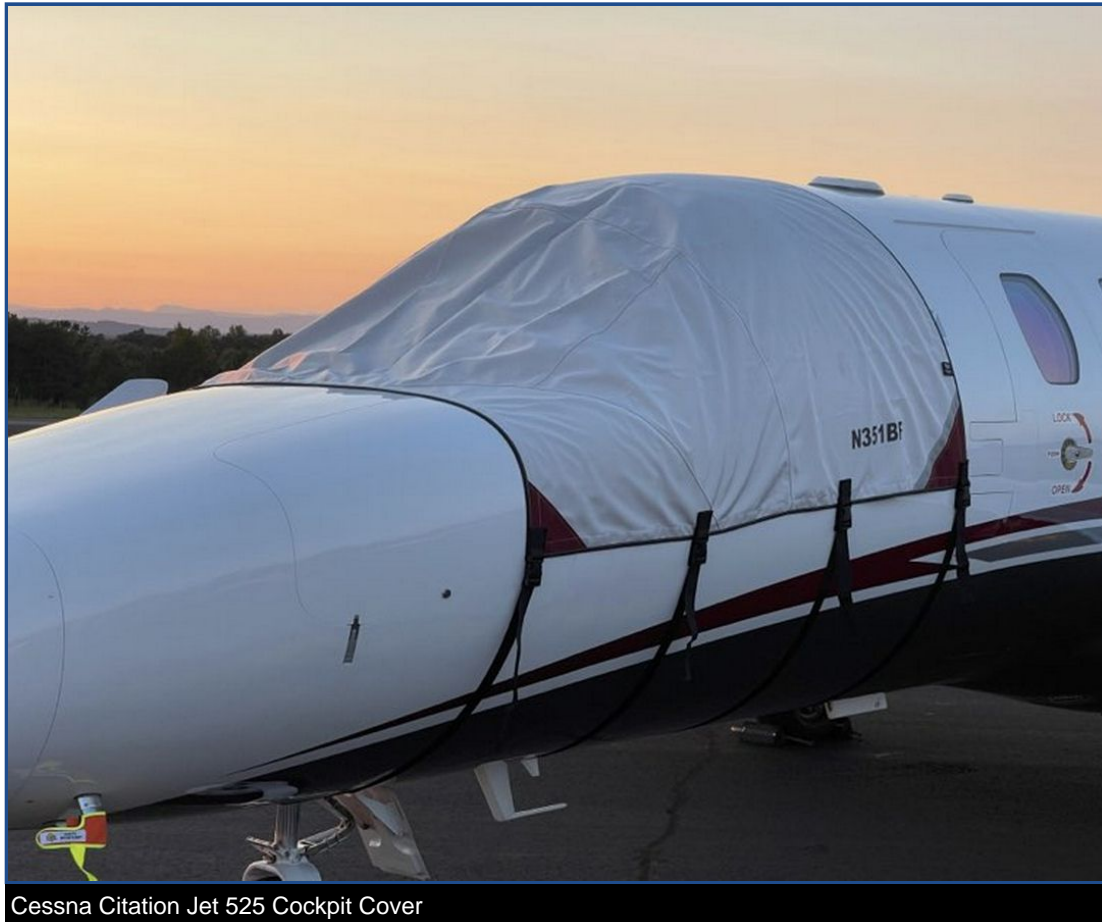
Cessna Citation Jet 525 Cockpit Cover