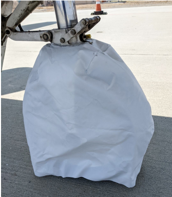
CJ1 Nose Gear Tire Cover, test fit