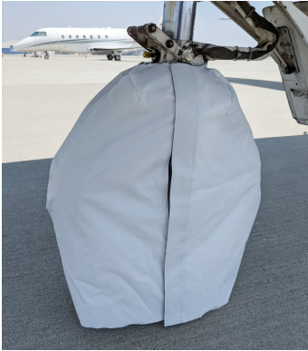
CJ1 Nose Gear Tire Cover, test fit

ALL-YEAR USE MATERIAL - Made with Silver Acrylic Sunbrella canvas, the all-year use material is the best option for sun protection and cover longevity. This heavier more durable material is intended for all weather conditions, such as rain and snow or lots of sun.