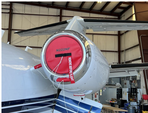
Cessna Citationjet 525A Intake Plugs Set

The Engine Inlet Plugs are custom fit for your Cessna Citationjet 525A, CJ-2, & CJ2+ intakes, made with heavy-duty vinyl material, and stuffed with a single block of sculpted urethane foam. Each plug has a zipper that allows the foam to be removed and dried if necessary. Engine plugs have 'remove before flight' streamers sewn onto the face of the plugs. Most plugs are imprinted with the aircraft registration number in black for an extra charge. Storage bag NOT included. Engine plugs may be inserted after flight when the engine is still warm. Engine Inlet Plugs are commonly referred to as Cowl Plugs, Intake Plugs, Cowl Blocks, Engine Blocks, and Engine Bungs.