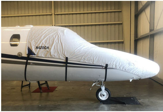
Cessna Citationjet CJ3 Cockpit/Nose Cover