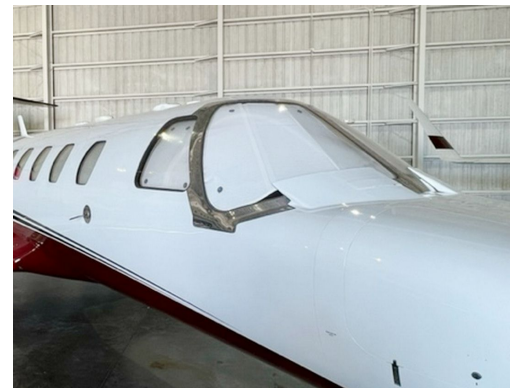
Cessna 525A Cockpit heatshields