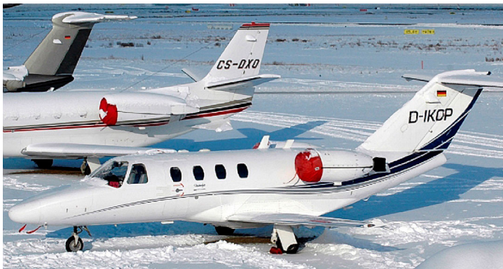
Engine Inlet Covers

The Cessna Citationjet 525A, CJ-2, & CJ2+ Intake/Exhaust Plugs are custom fit for the intake and exhaust openings, made with heavy-duty vinyl material, and stuffed with a single block of sculpted urethane foam. Each plug has a zipper that allows the foam to be removed and dried if necessary. Engine plugs have 'remove before flight' streamers sewn onto the face of the plugs. Most plugs are imprinted with the aircraft registration number in black. Engine plugs may be inserted after flight when the engine is still warm. Engine Inlet Plugs are commonly referred to as Cowl Plugs, Intake Plugs, Cowl Blocks, Engine Blocks, and Engine Bungs.