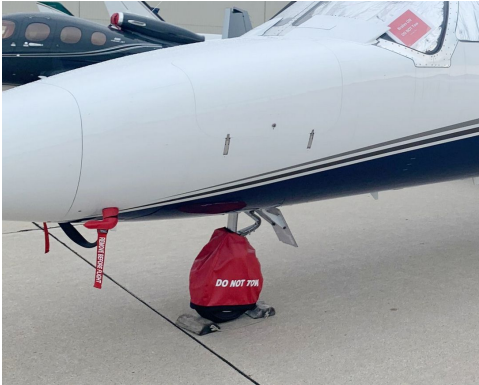
Cessna Citation Nose Tire Cover

ALL-YEAR USE MATERIAL - Made with Silver Acrylic Sunbrella canvas, the all-year use material is the best option for sun protection and cover longevity. This heavier more durable material is intended for all weather conditions, such as rain and snow or lots of sun.