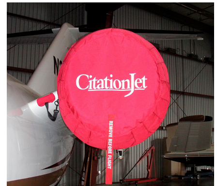
Cessna Citation Engine Cover Set