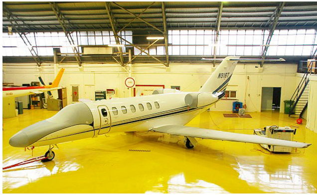
Cessna Citationjet CJ3 Cockpit/Nose, Engine & Wings Travel Covers