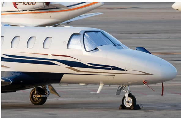
Cessna Citationjet 525, CJ-I, CJ1+, & M2 Cockpit Heatshields

Custom-made Heatshield Sunshades are available for almost any window in the jet. Side windows, Skylights, and Emergency Exits are all custom-made. The product is a unique composite of closed-cell foam with a silver mylar finish. The set is easily stored in the included storage sleeve. Some designs may require velcro and suction cups. Our Heatshields are offered white side out since aircraft manufacturers have issued advisories against reflective window inserts due to potential heat damage.