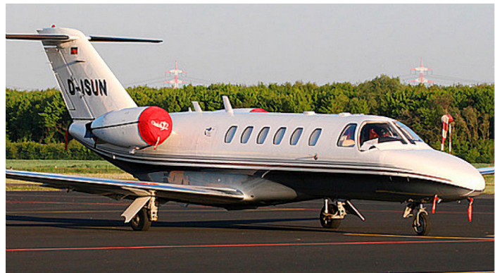
Engine Inlet/Exhaust Covers