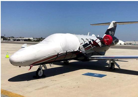
Citationjet CJ1 Cockpit/Nose Cover