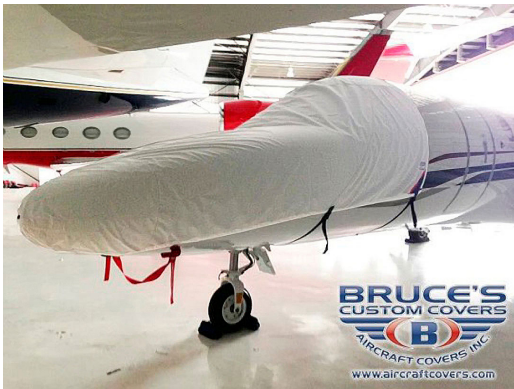
Citation CJ4 Cockpit/Nose Cover and Heat Resistant Pitot Covers set

Travel Covers are made with Silver Solution-Dyed Polyester fabric and only lined over the windshield to save weight. The material is lightweight and more compact for easy stowage in the aircraft. The polyester material is water resistant, but only intended for occasional use outside. We also have an ultra lightweight material available for fitted hangar dust covers. For daily outdoor use, the non-travel Sunbrella Cover is the best choice.