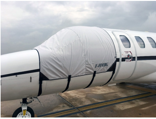
Cessna Citationjet 525A, CJ-2, & CJ2+ Cockpit Cover