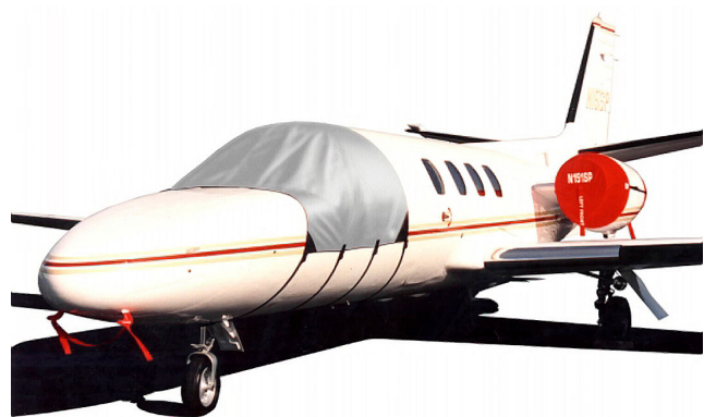
Cessna Citation Windshield Cover, Engine Cover set and Pitot Covers