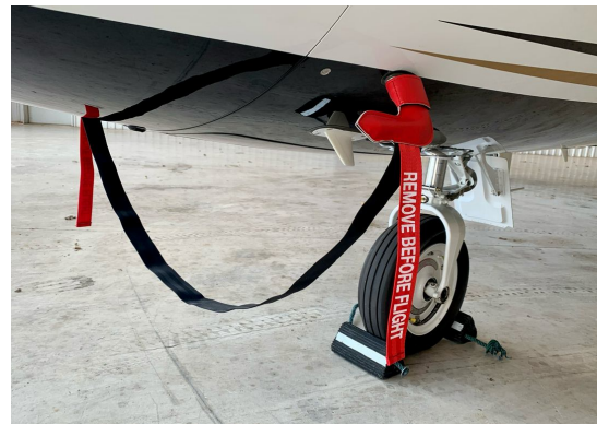
Cessna Citationjet CJ1 Pitot Cover Set