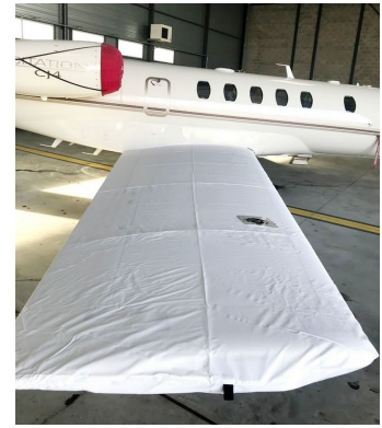
Cessna Citation CJ-4 Wing Covers, test fit cover