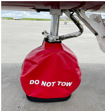
Citationjet CJ-3 Nose Gear Tire Cover

ALL-YEAR USE MATERIAL - Made with Silver Acrylic Sunbrella canvas, the all-year use material is the best option for sun protection and cover longevity. This heavier more durable material is intended for all weather conditions, such as rain and snow or lots of sun.