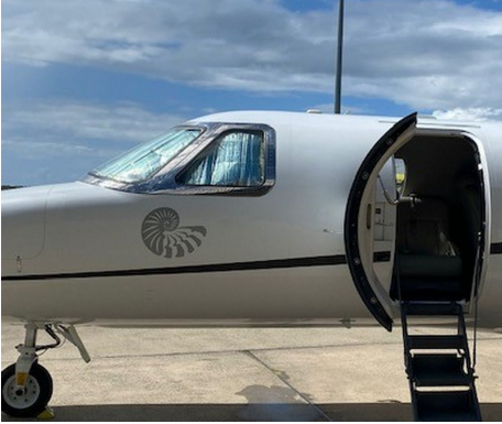
Cessna Citationjet CJ2 Cockpit HeatShields

Custom-made Heatshield Sunshades are available for almost any window in the jet. Side windows, Skylights, and Emergency Exits are all custom-made. The product is a unique composite of closed-cell foam with a silver mylar finish. The set is easily stored in the included storage sleeve. Some designs may require velcro and suction cups. Our Heatshields are offered white side out since aircraft manufacturers have issued advisories against reflective window inserts due to potential heat damage.