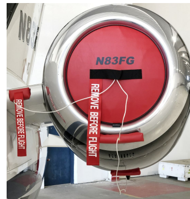
Cessna Citation Mustang 510 Engine Plugs