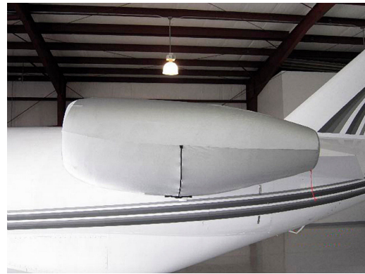
Citation CJ3 Bikini Style Engine Cover Set, full nacelle enclosure