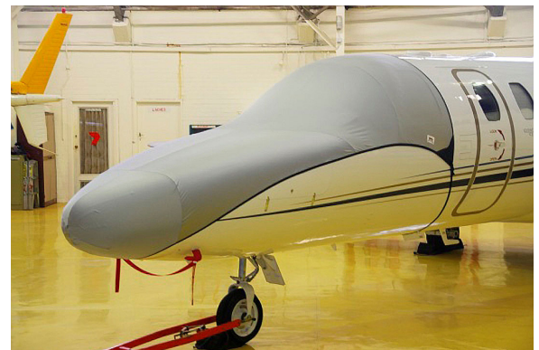
Citationjet CJ3 Cockpit/Nose Travel Cover